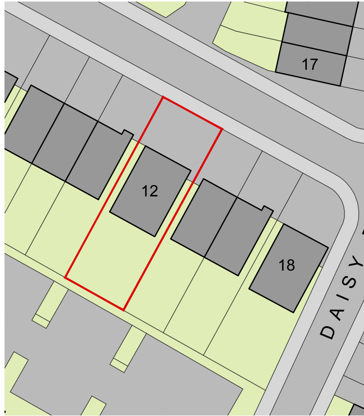
[02] BLOCK PLAN 1:500