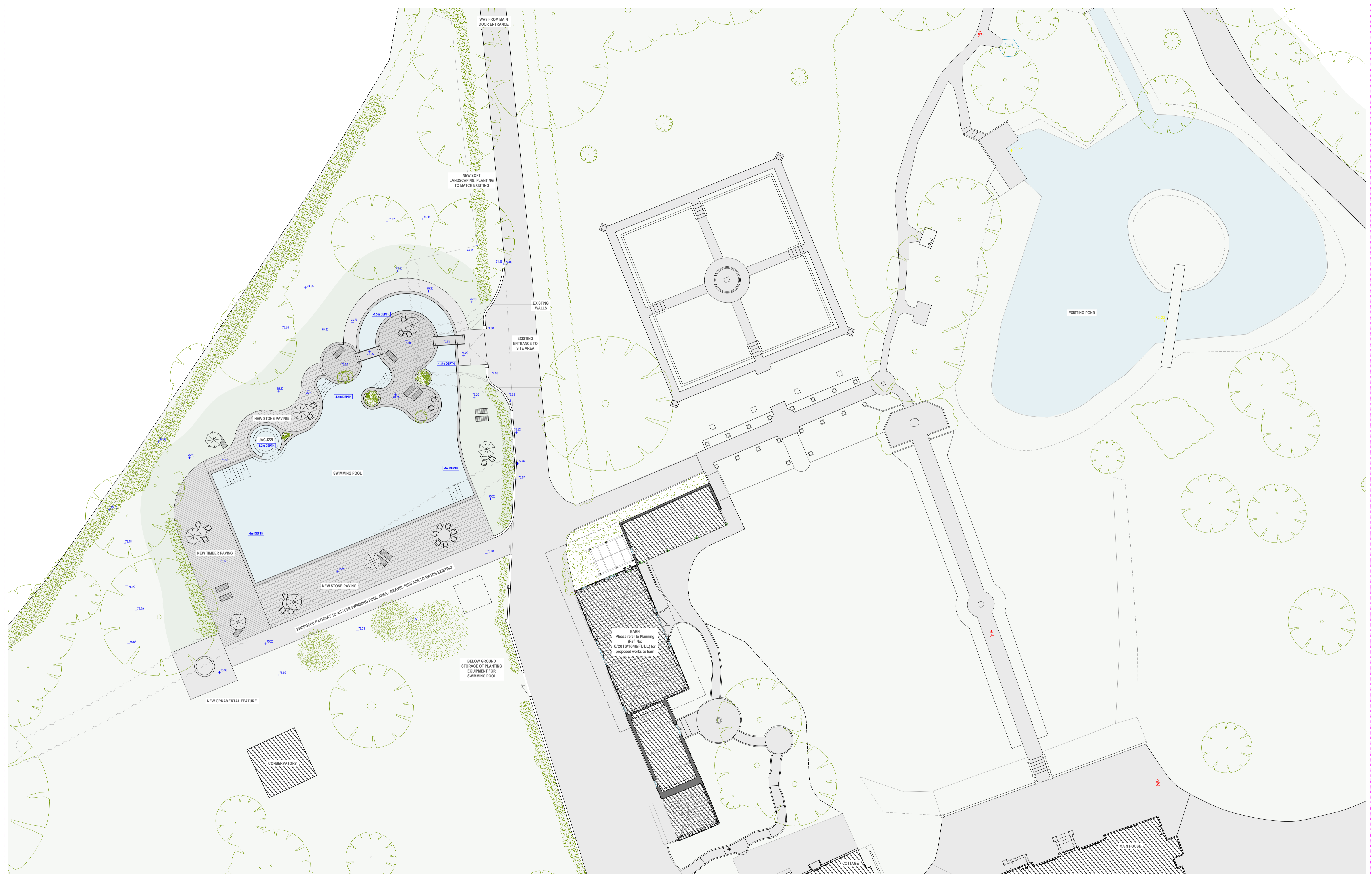
011 PROPOSED SITE PLAN - SWIMMING POOL

NOTE: DO NOT SCALE FROM DRAWINGS - EXCEPT FOR PLANNING PURPOSES. ALL DISCREPANCIES TO BE REPORTED TO ARCHITECT IMMEDIATELY. ALL DIMENSIONS TO BE VERIFIED BY CONTRACTOR ON SITE PRIOR TO THE COMMENCEMENT OF ANY WORKS.