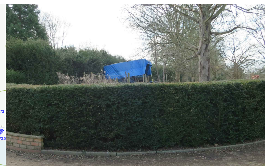
1. VIEW FROM THE DRIVE WAY - EXISTING HEDGING TO BE RETAINED