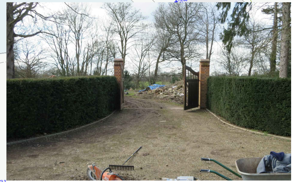
2. EXISTING GATE TO SITE AREA TO BE DEMOLISHED AND REPLACED