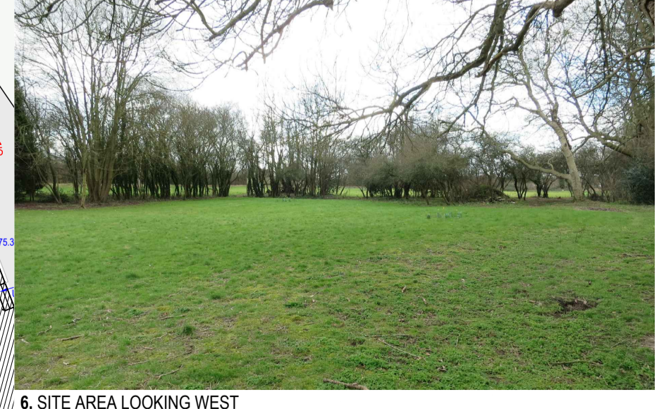
6. SITE AREA LOOKING WEST