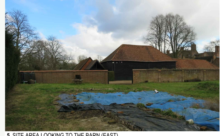
5. SITE AREA LOOKING TO THE BARN (EAST)