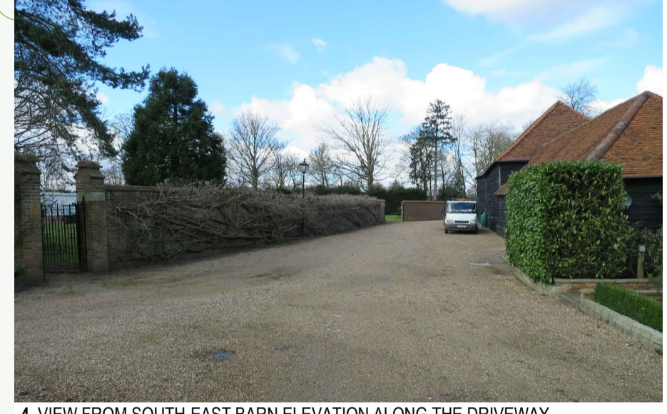
4. VIEW FROM SOUTH-EAST BARN ELEVATION ALONG THE DRIVEWAY