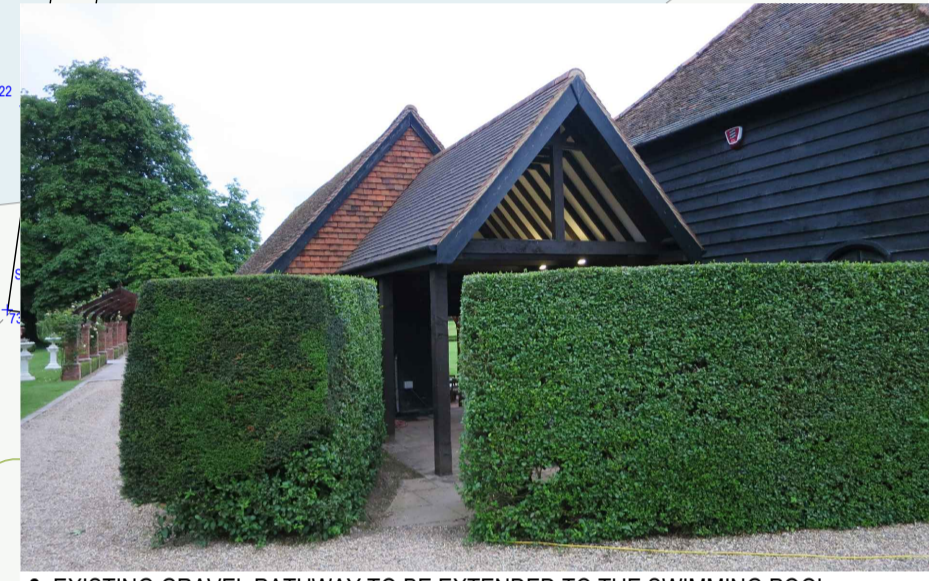
3. EXISTING GRAVEL PATHWAY TO BE EXTENDED TO THE SWIMMING POOL