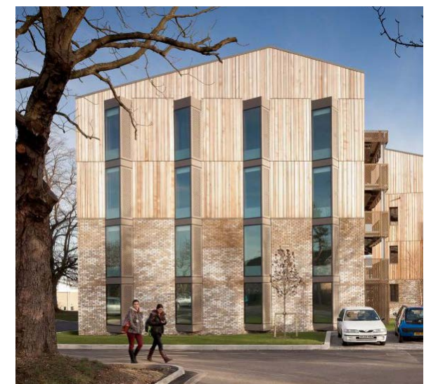
6. Engineered timber cladding, light buff brickwork + directional windows