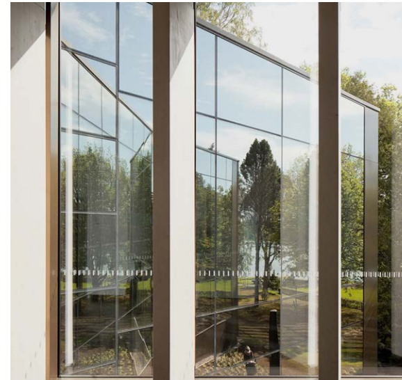
1. Reflective glazed curtain walling