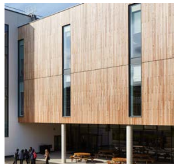
5. Engineered timber cladding