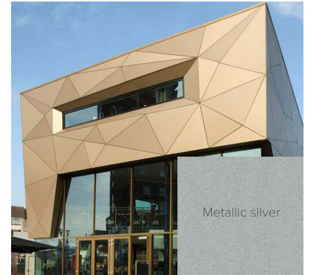
2. Metallic façade cladding panels