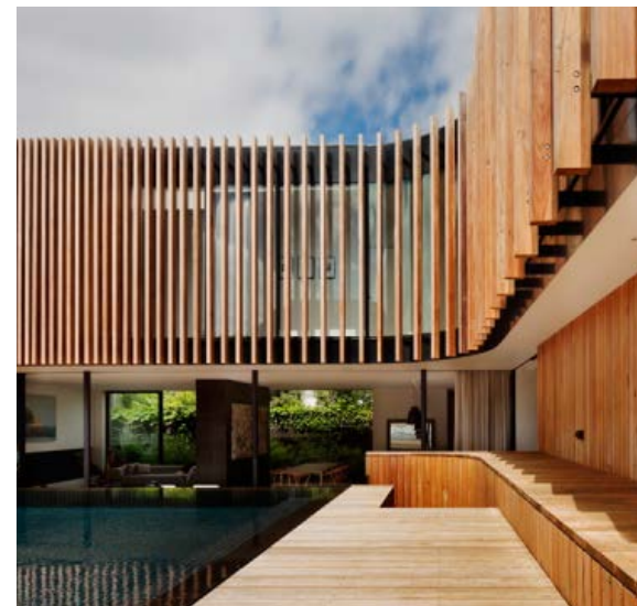
3. Vertical projecting fins