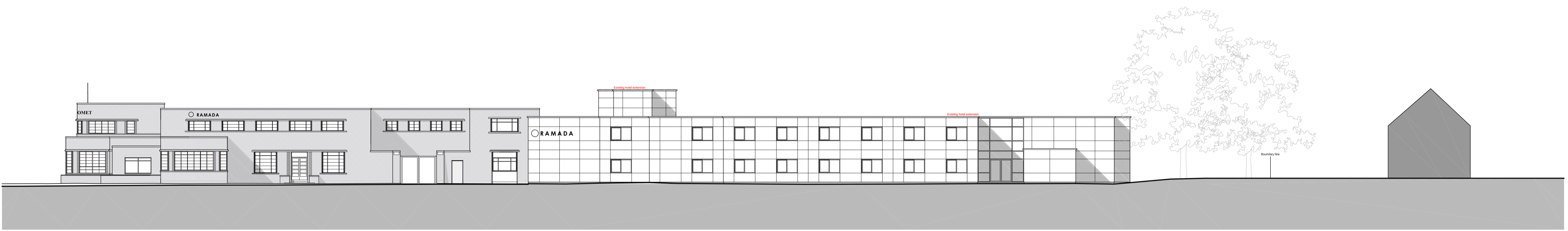
B. North West (Side) Elevation