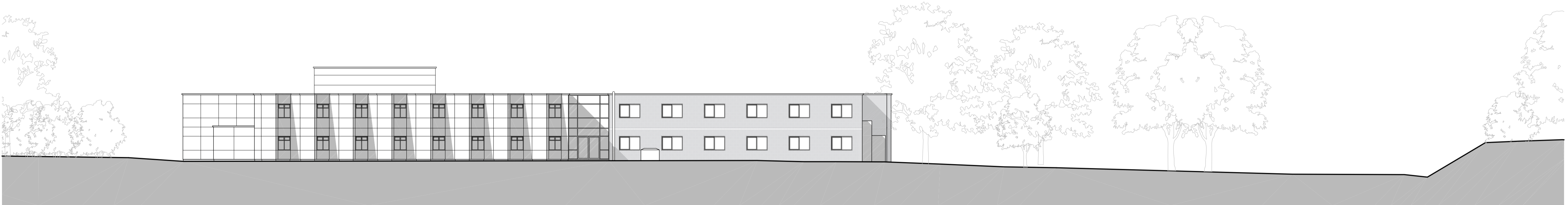
C. South West (Rear) Elevation