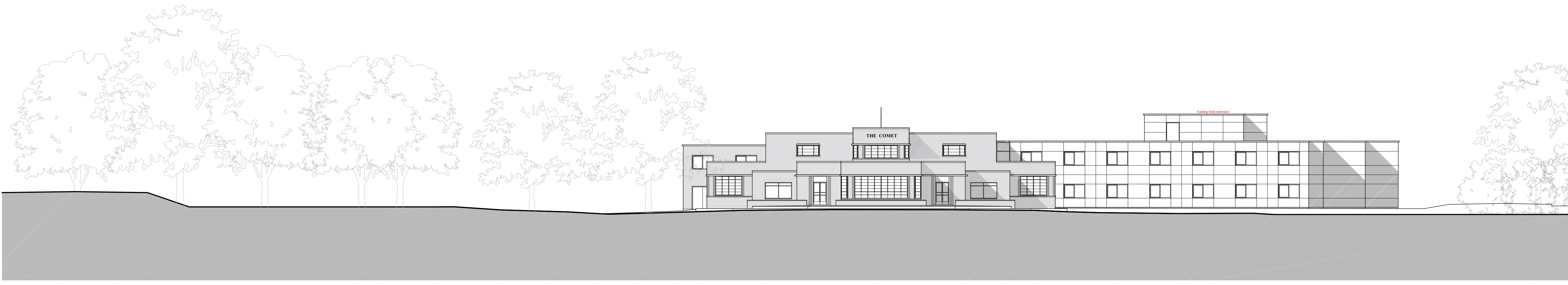
A. North East (Front) Elevation