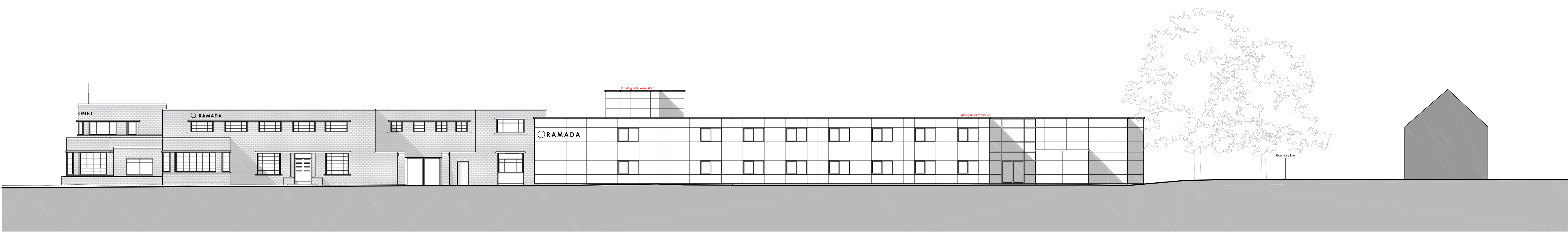
B. North West (Side) Elevation