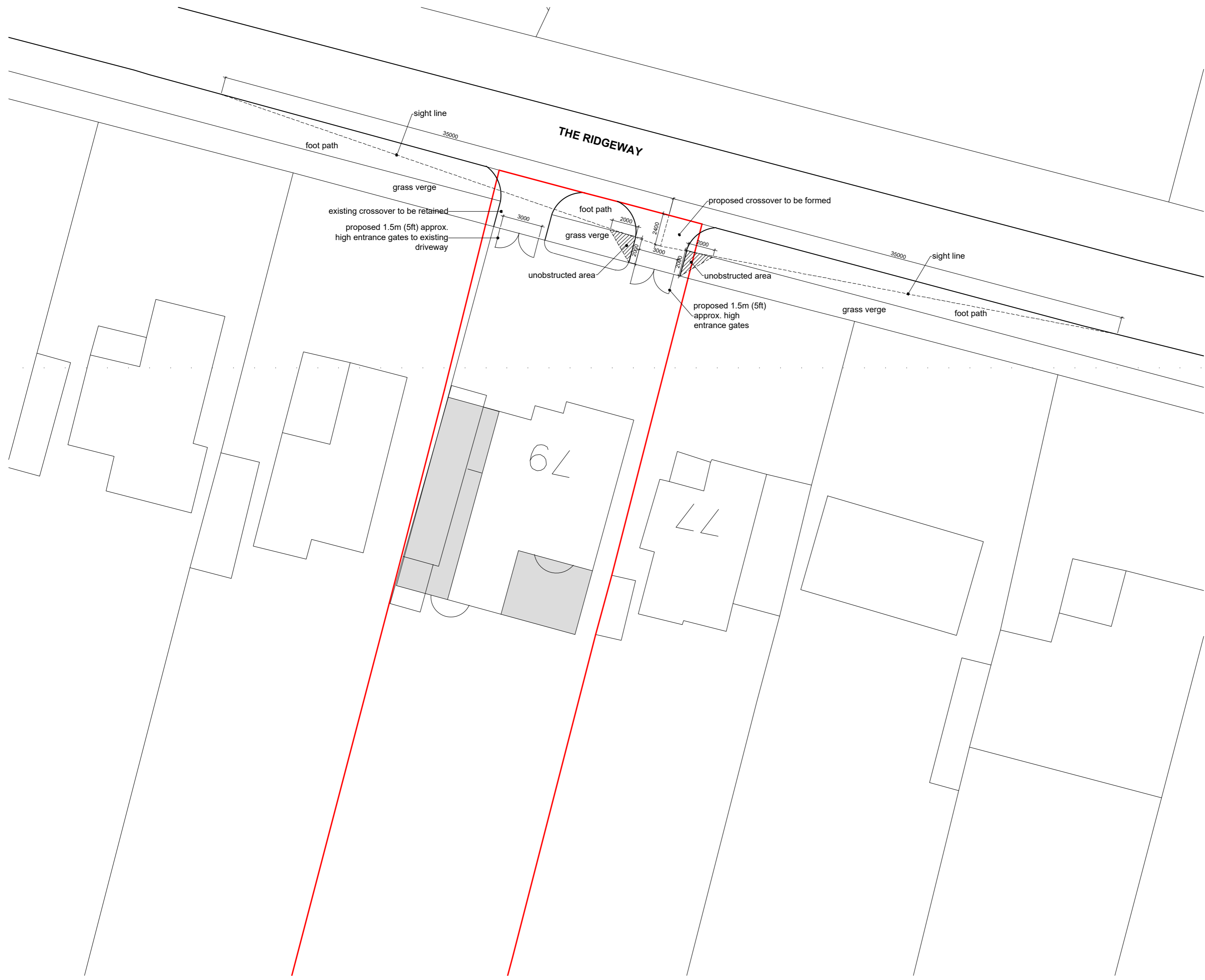
Site Plan 1:200