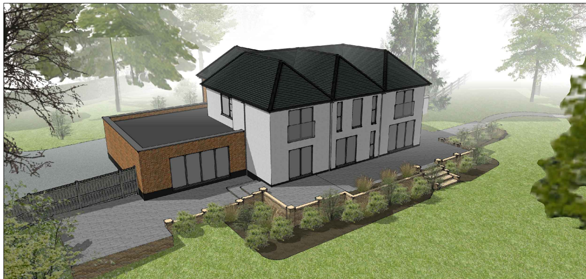
[03] PROPOSED REAR VISUAL