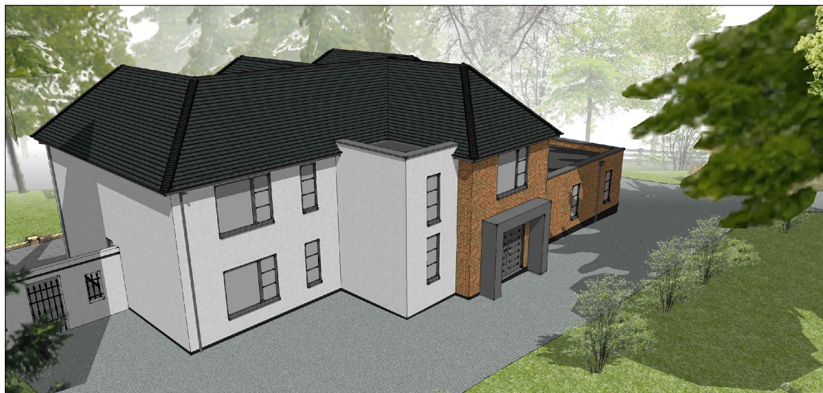
[02] PROPOSED FRONT VISUAL