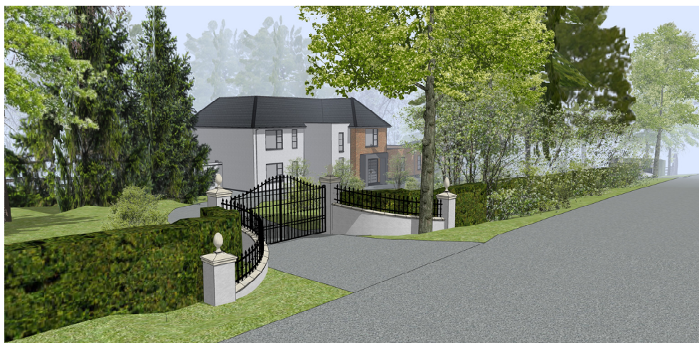
PROPOSED ENTRANCE GATE