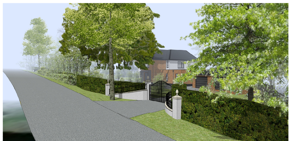
PROPOSED EXIT GATE