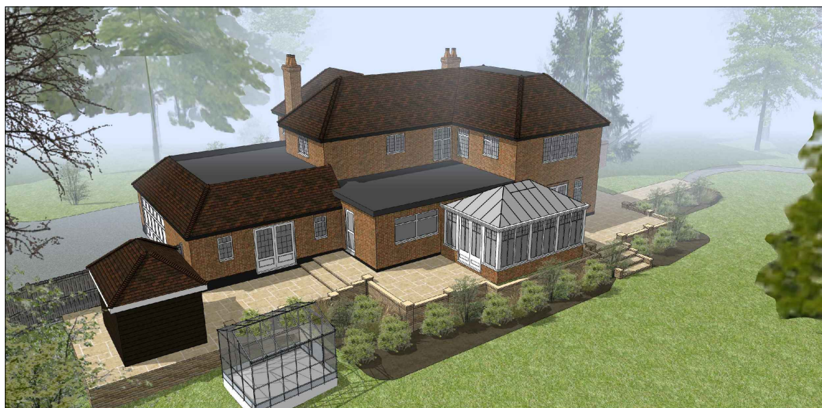
[03] EXISTING REAR VISUAL