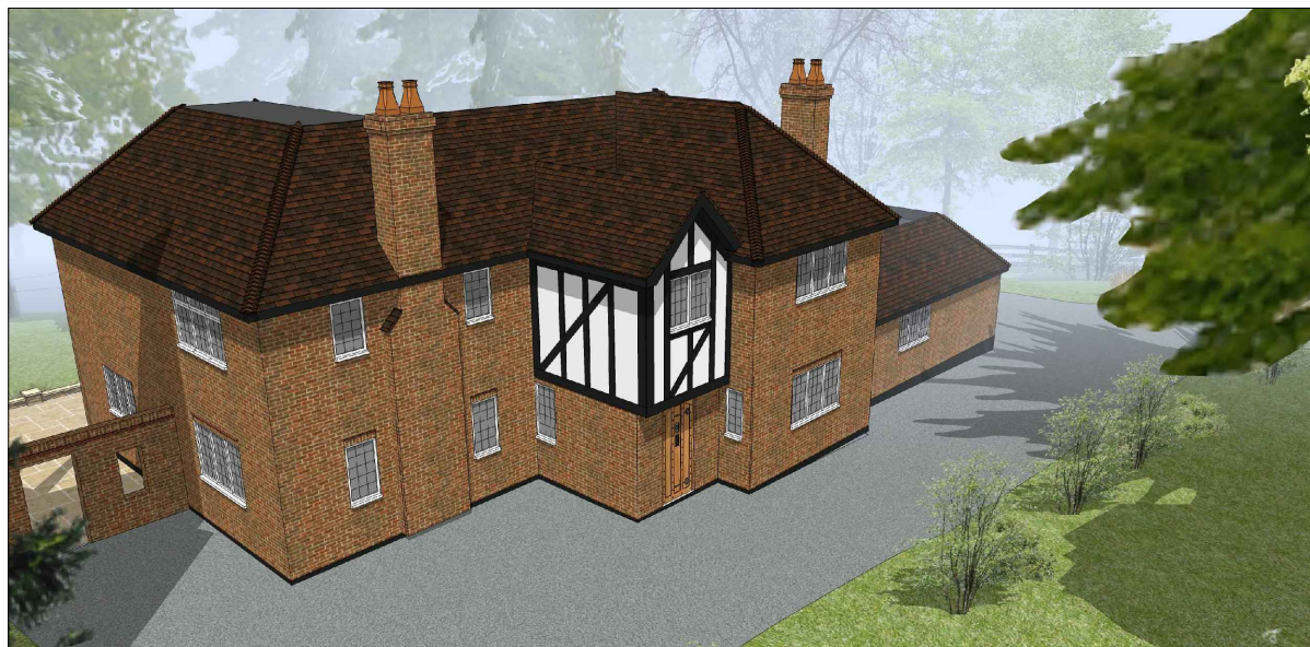
[02] EXISTING FRONT VISUAL