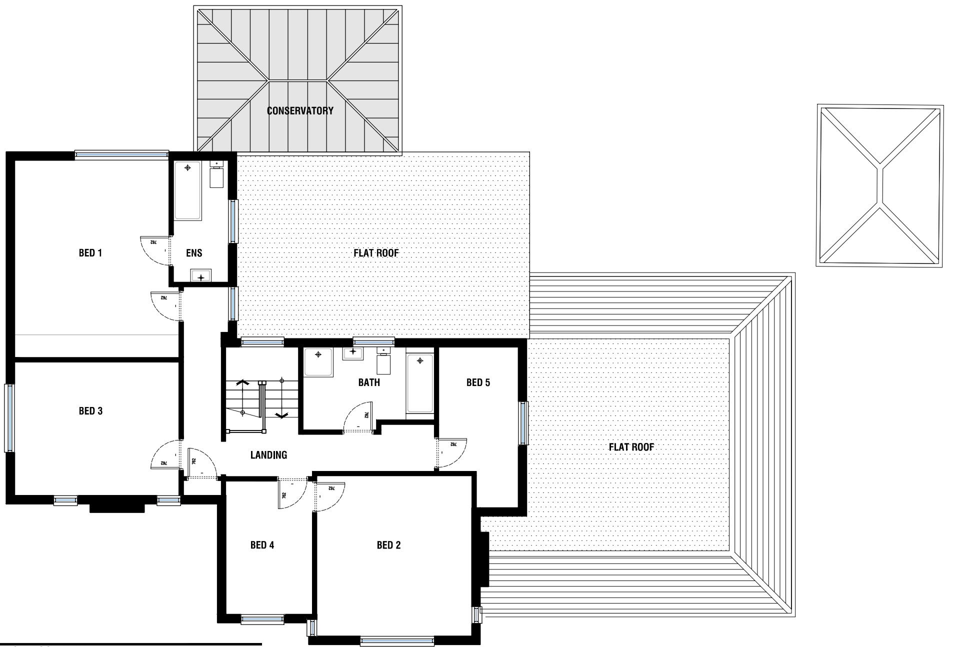
[02] EXISTING FIRST FLOOR PLAN