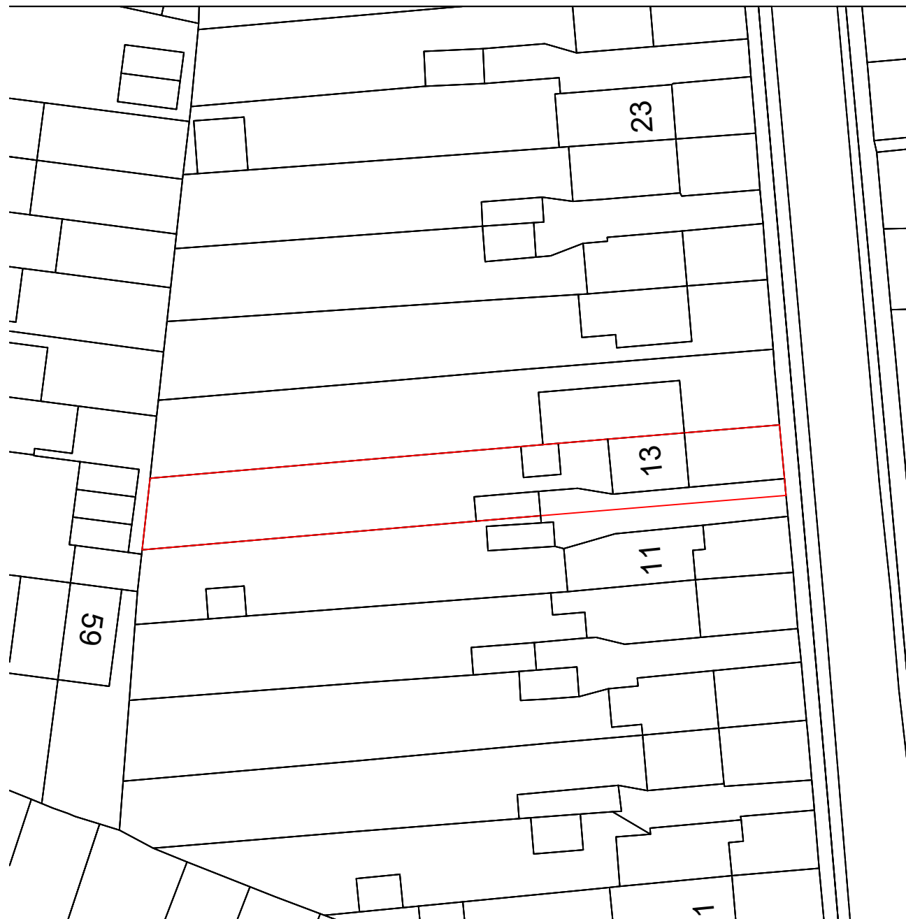
existing block plan