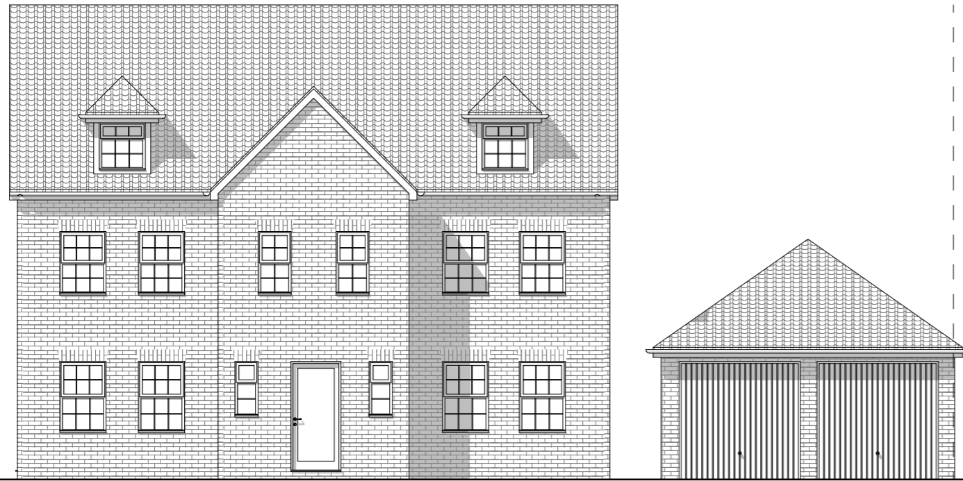
Existing Front Elevation 1:100