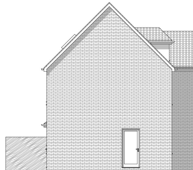
Existing Side Elevation 1:100