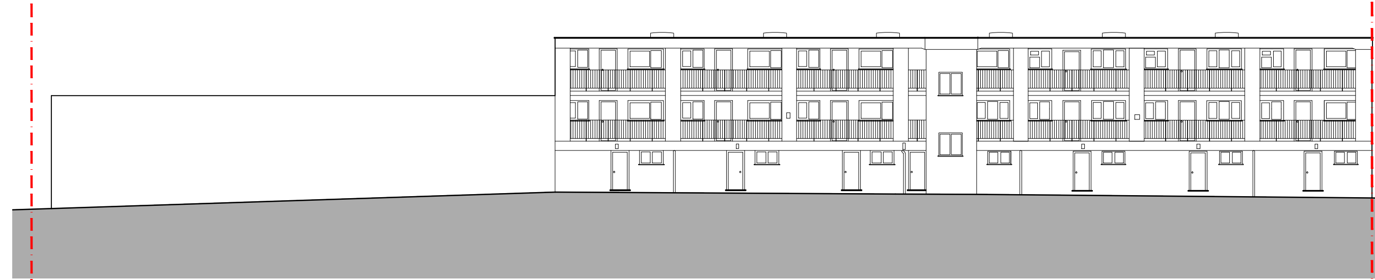
Existing West Elevation 1:200 @ A3