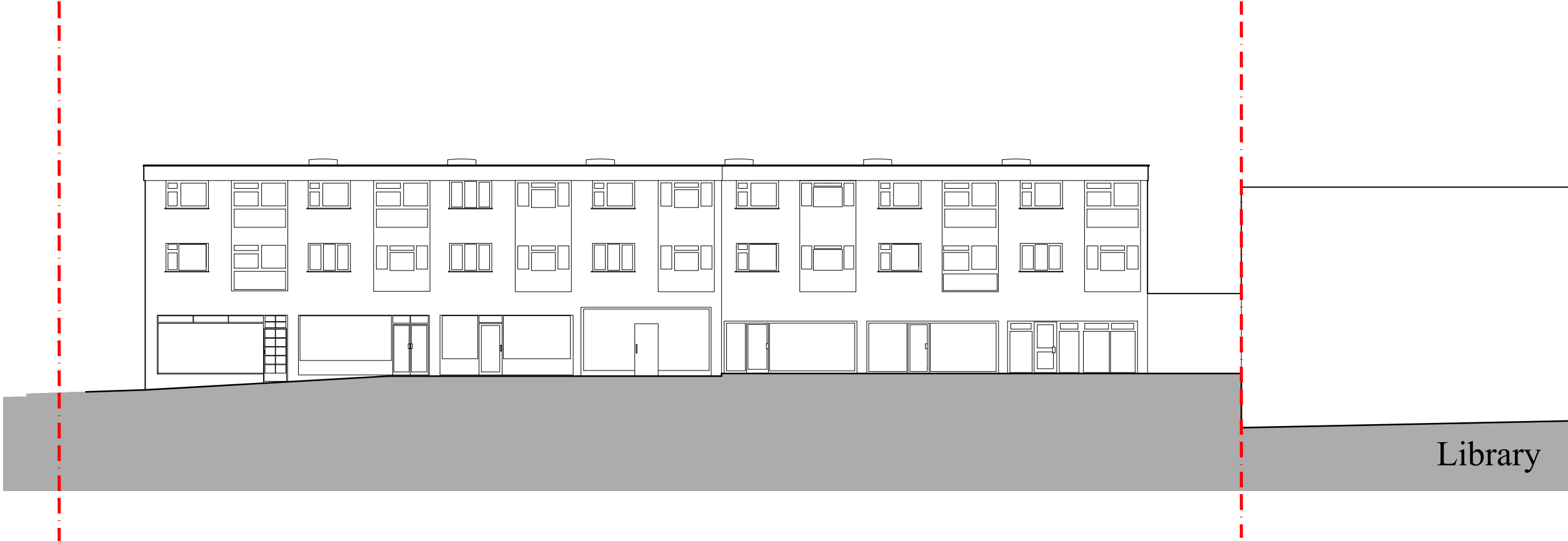
Existing East Elevation 1:200 @ A3