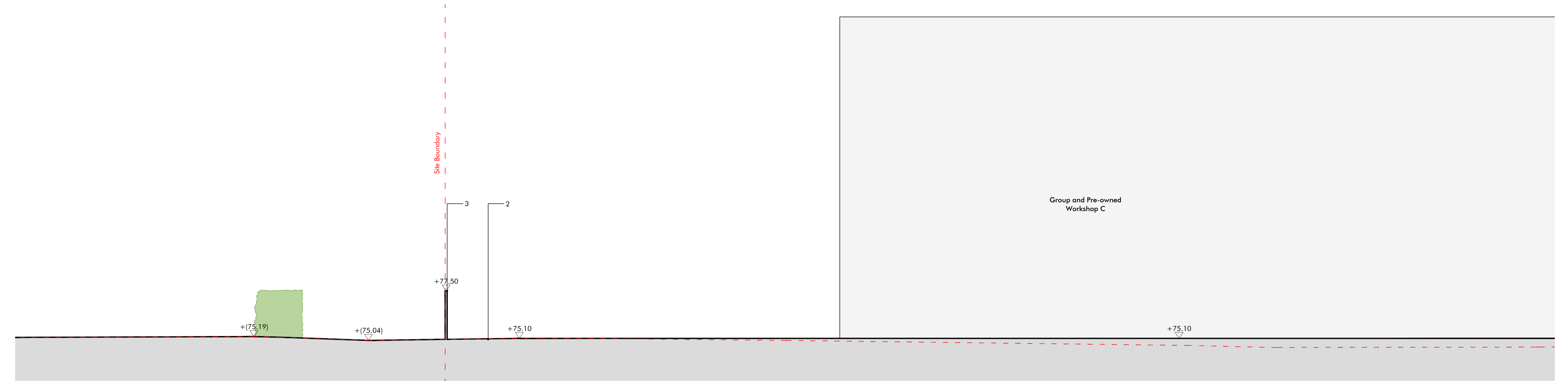
Proposed Condition Section F-F