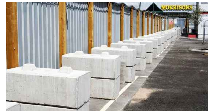
Ballast Block System