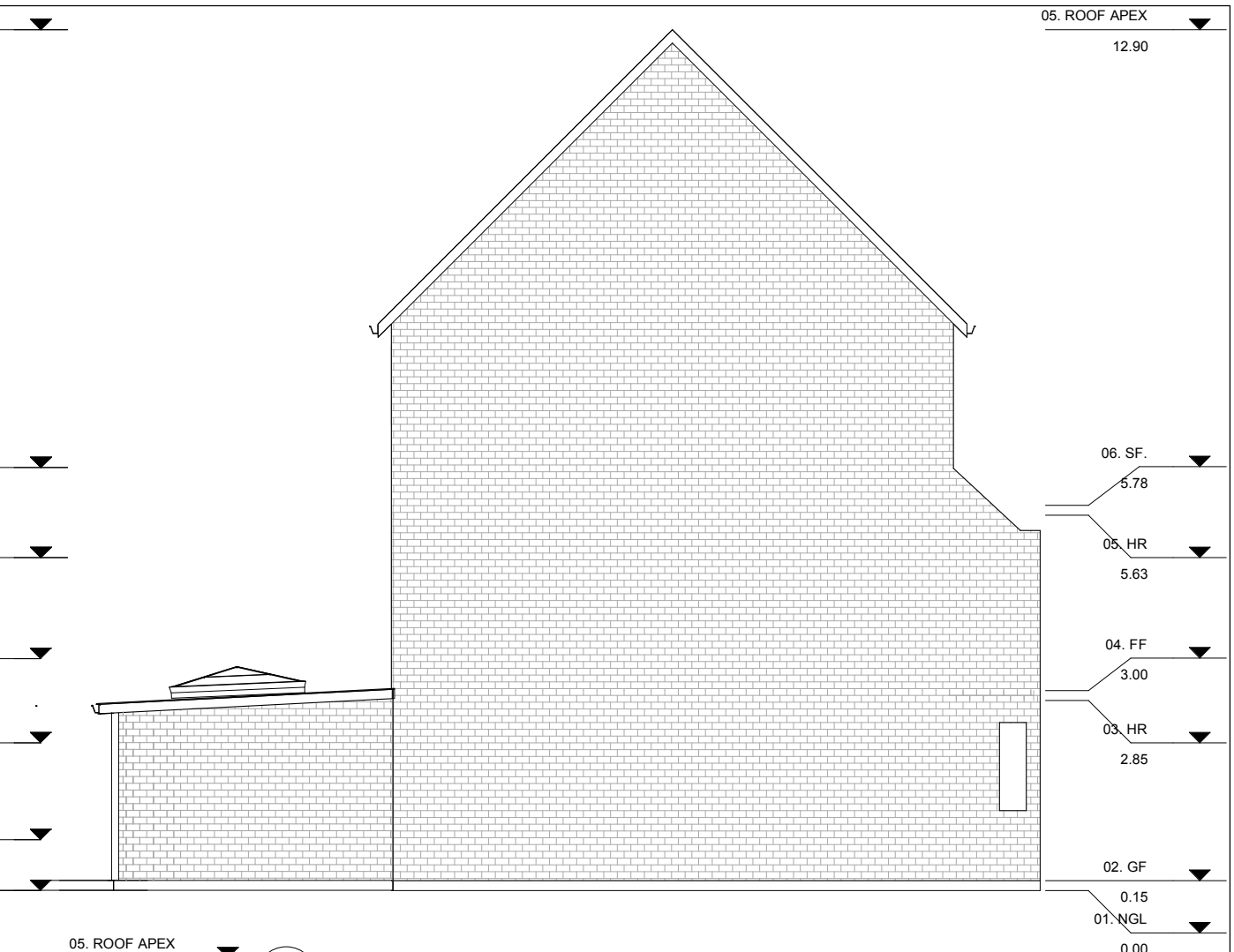
2 PROPOSED RIGHT-SIDE ELEVATION 1 : 100