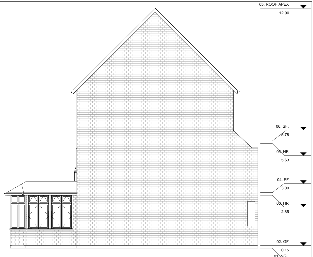
2 PROPOSED RIGHT-SIDE ELEVATION 1 : 100

Juliet Balcony with no extended platform for external access