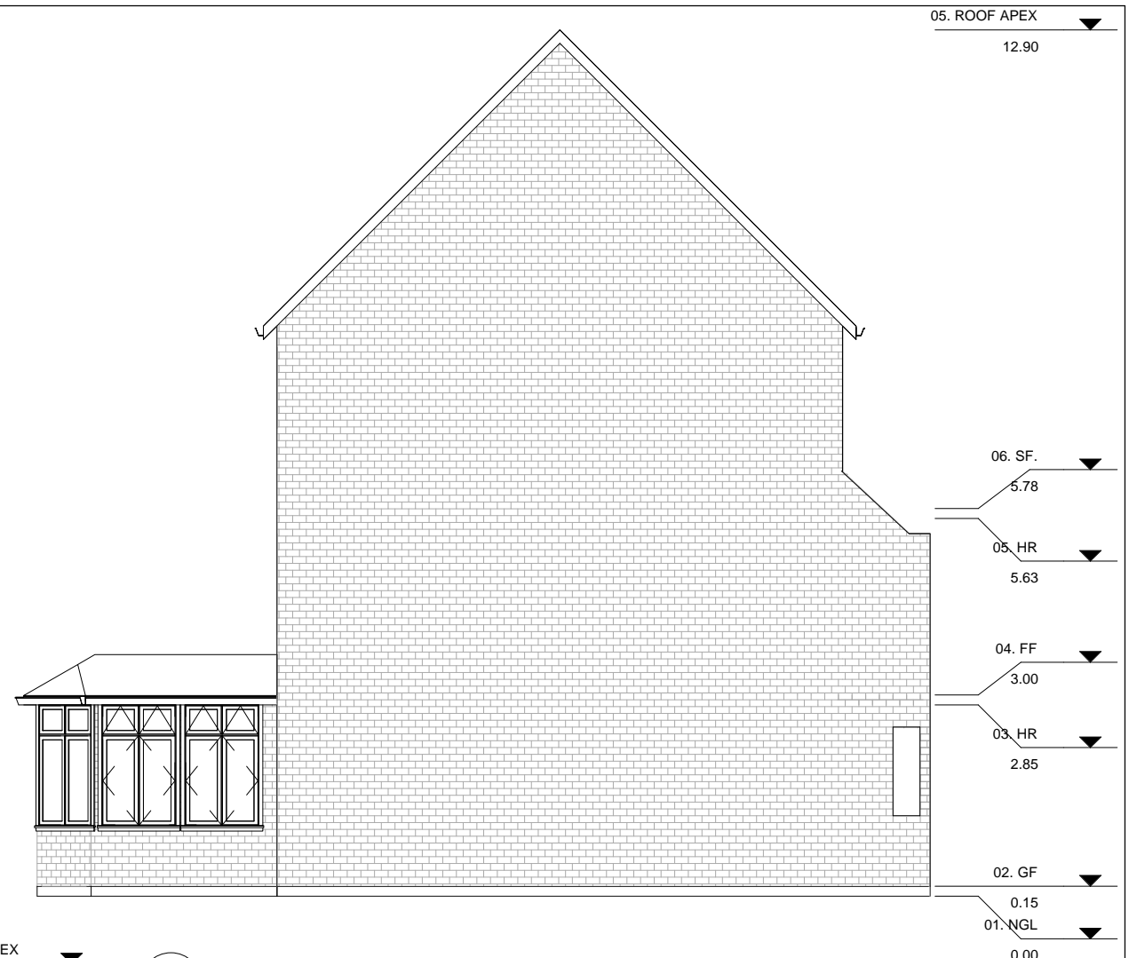
2 EXISTING RIGHT-SIDE ELEVATION 1 : 100