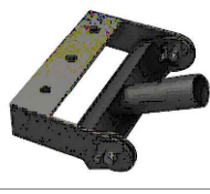
TYPE X1B 'B' DENOTES MOUNTING BRACKET