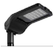
TYPE X1 & X2