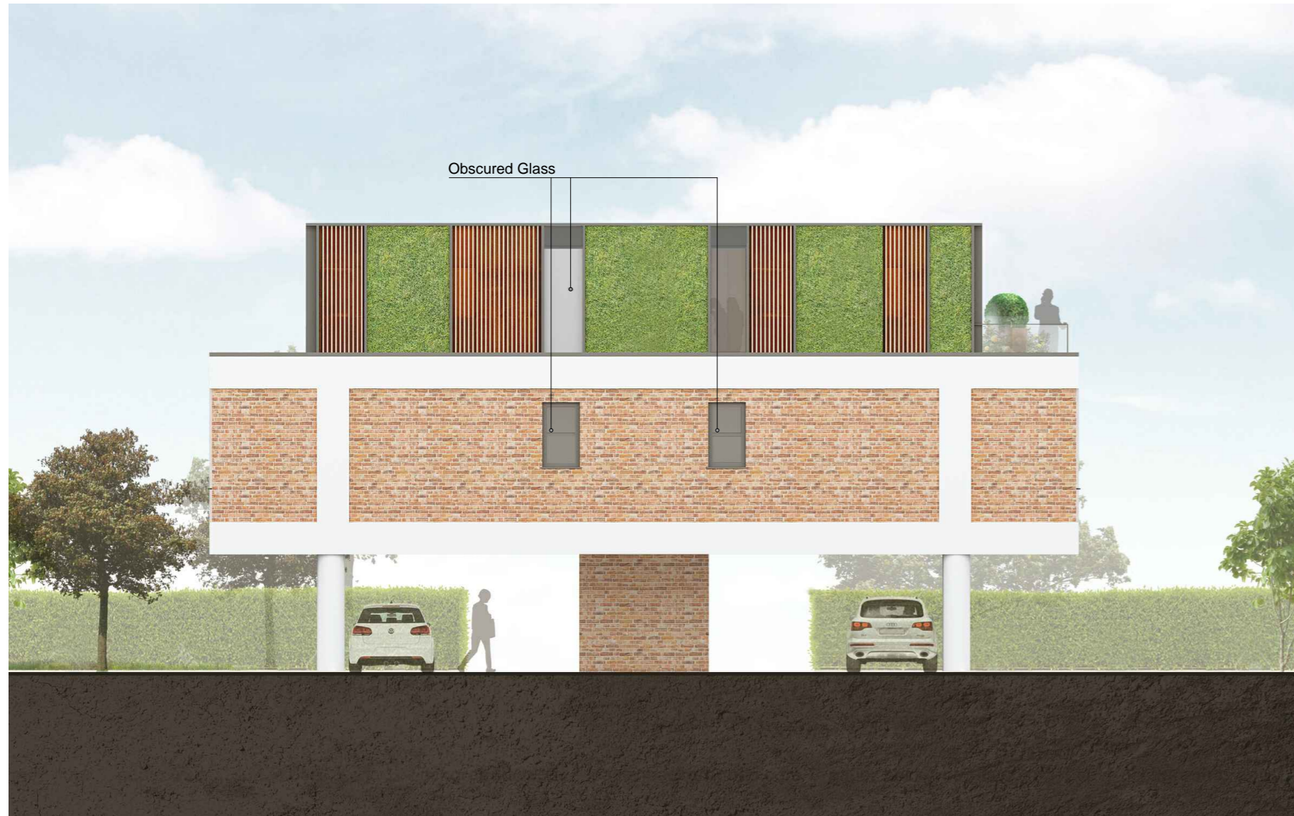
1 Proposed North Elevation 1:100