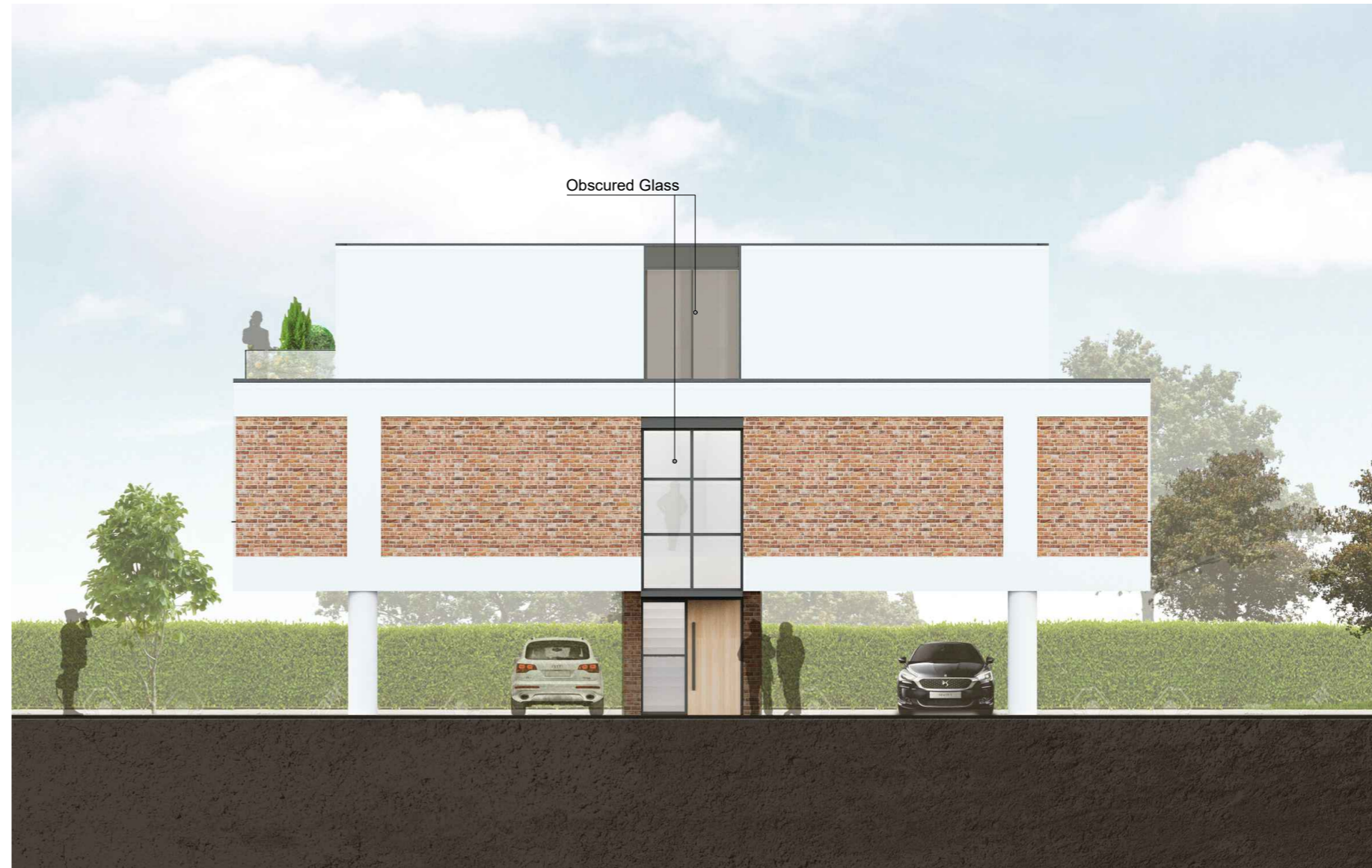
3 Proposed North Elevation 1:100