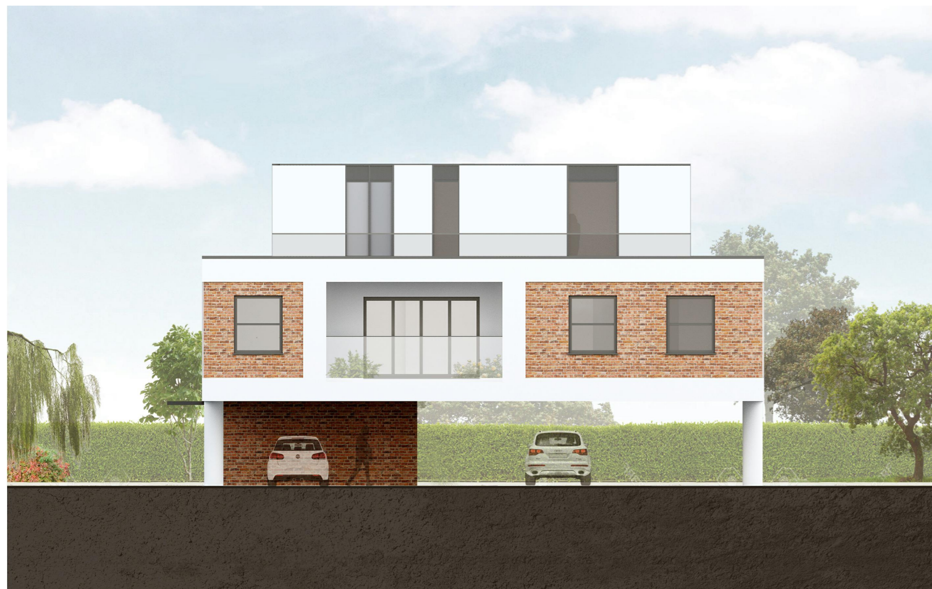
2 Proposed West Elevation 1:100