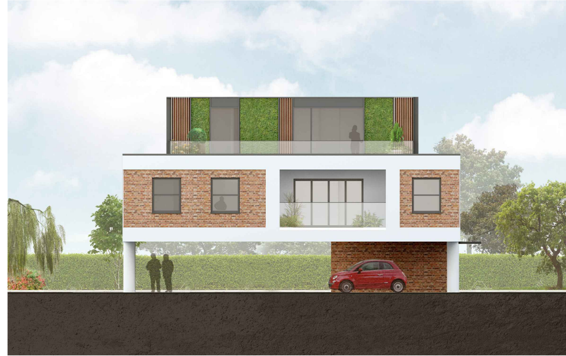
4 Proposed West Elevation 1:100