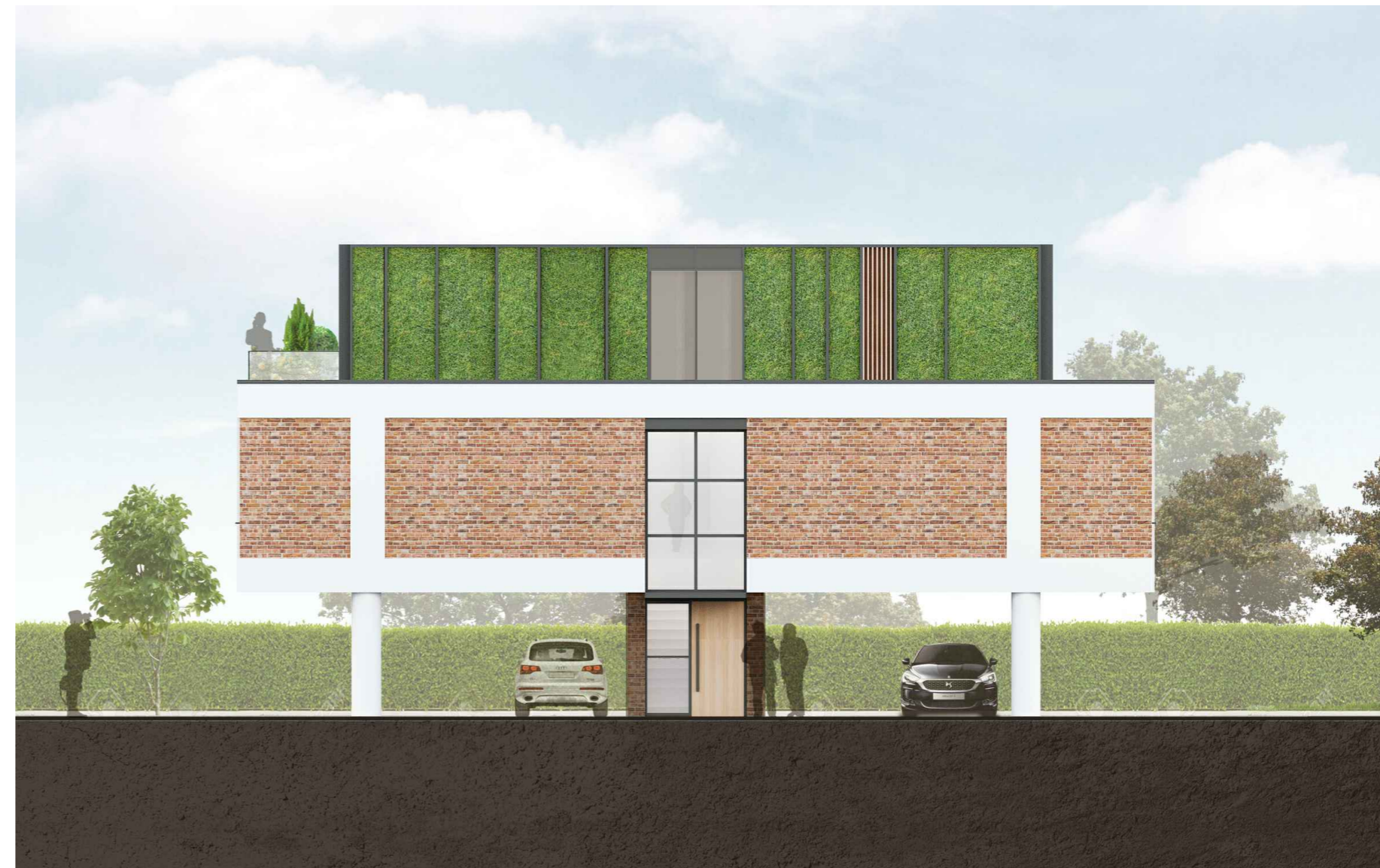
3 Proposed South Elevation 1:100