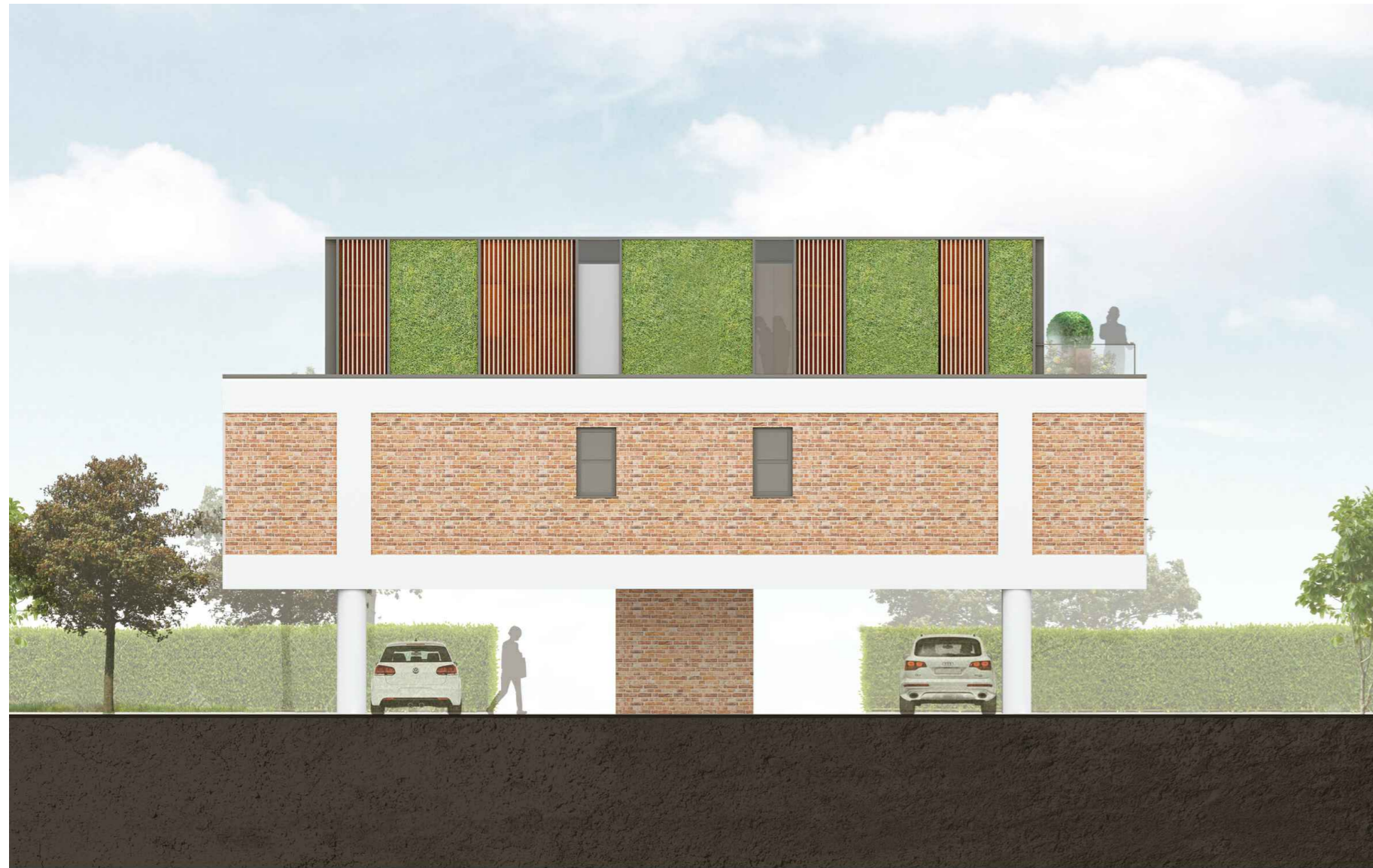
1 Proposed North Elevation 1:100