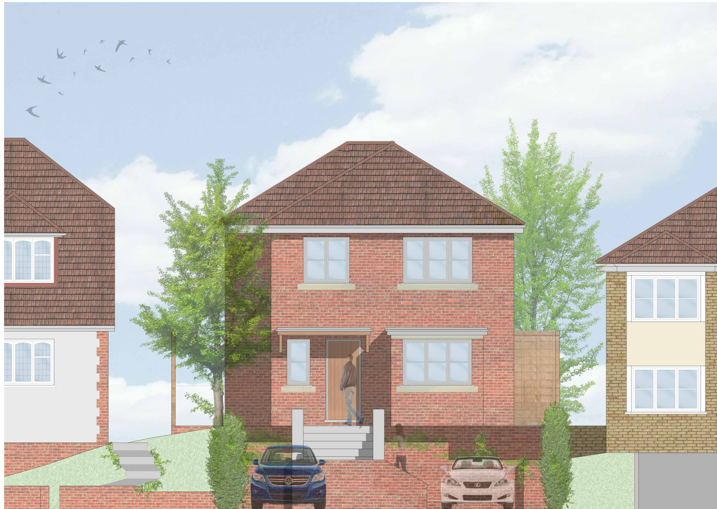
1 Proposed Street Elevation 1:100