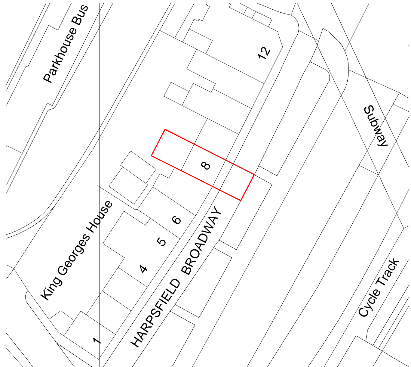
EXISTING SITE PLAN @ 1:500 SCALE