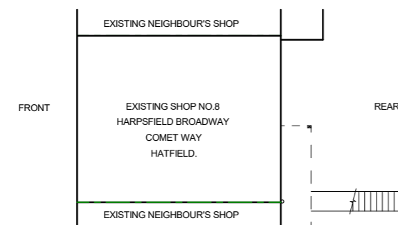
EXISTING BLOCK PLAN (SCALE 1:200)