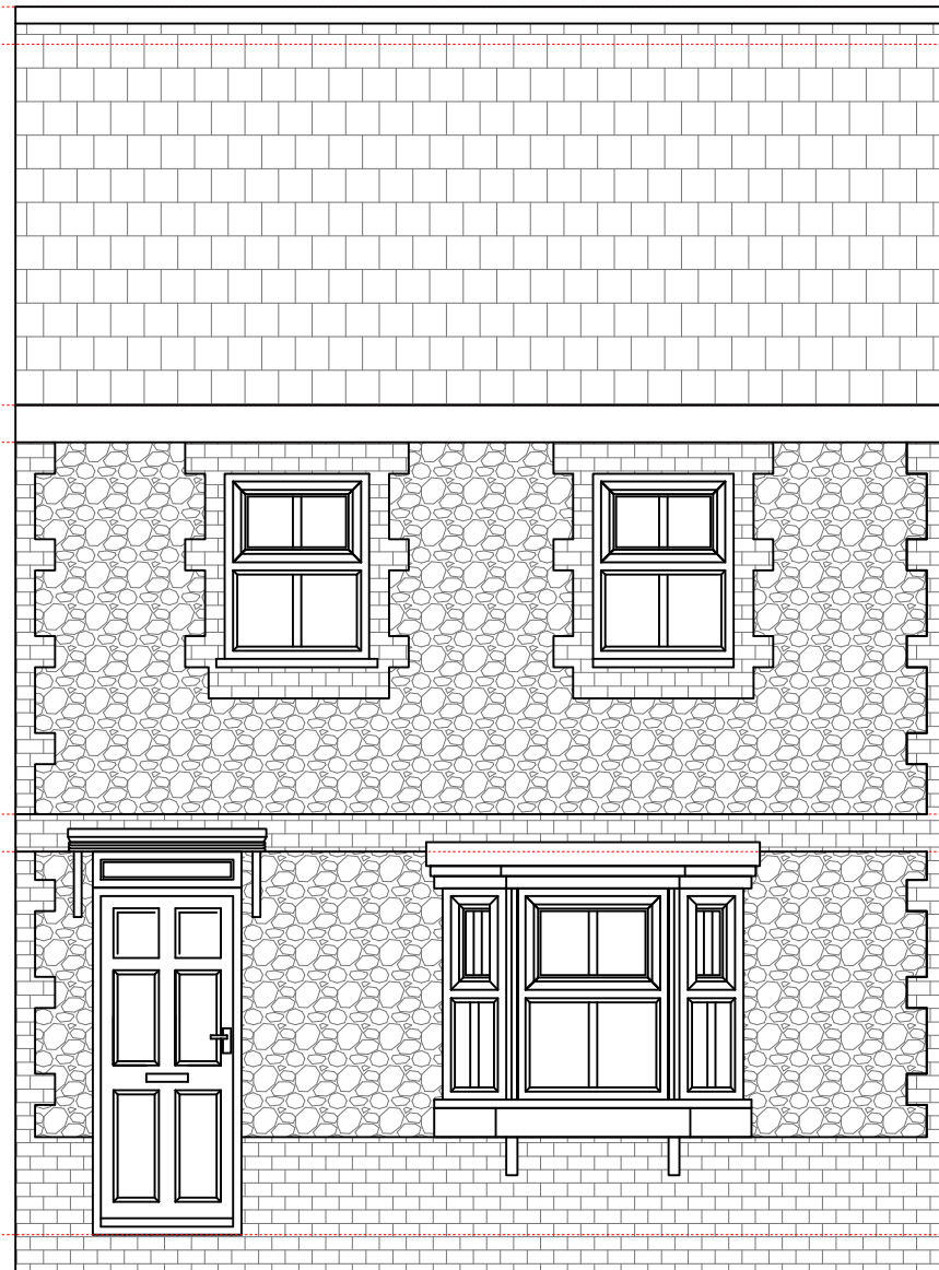
FRONT ELEVATION [AS EXISTING]