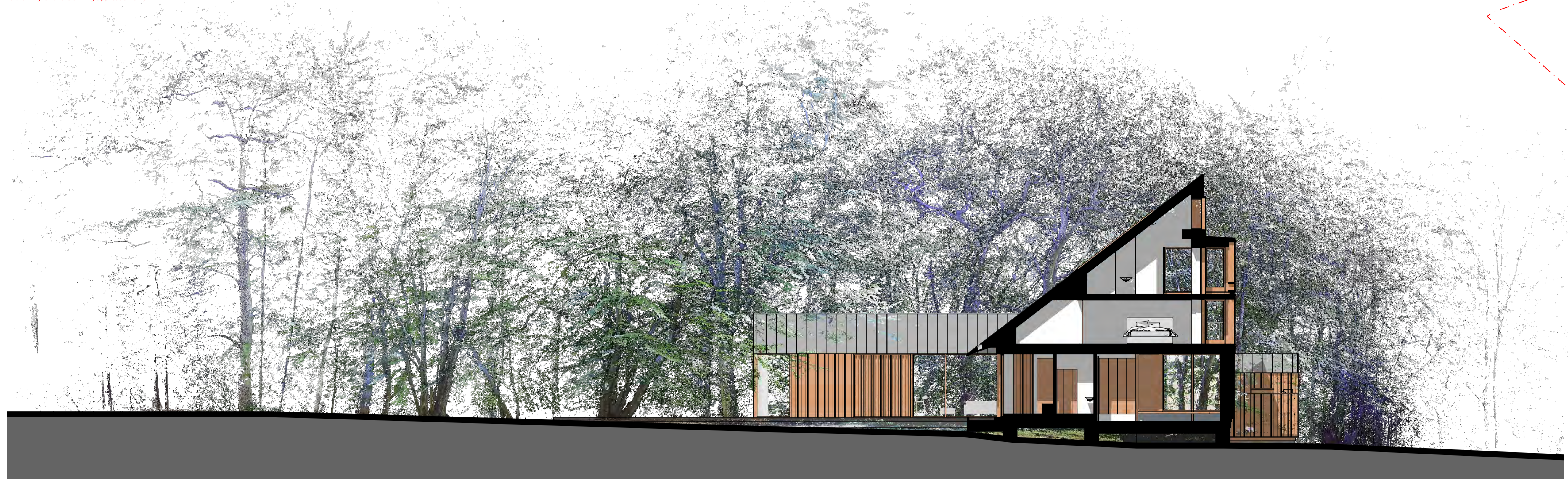
Section / Elevation C (with trees)