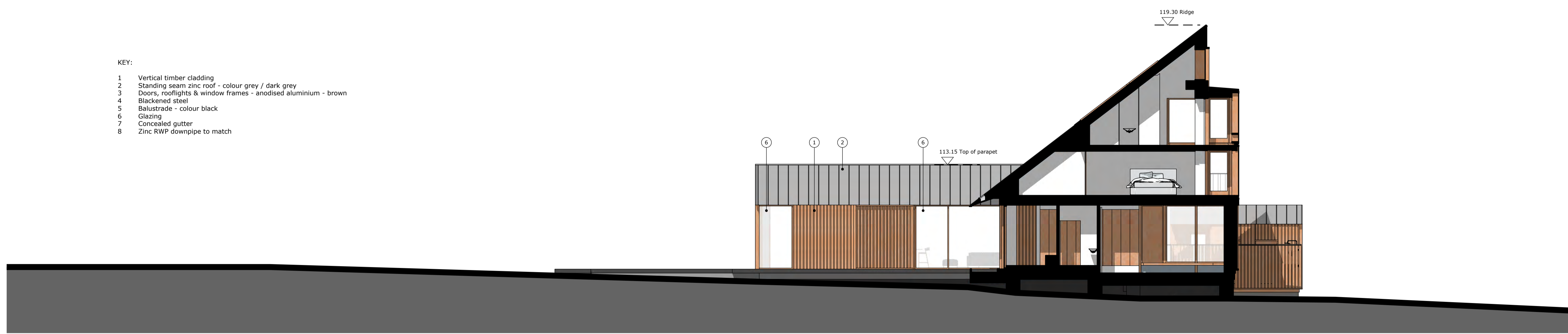
Section / Elevation C