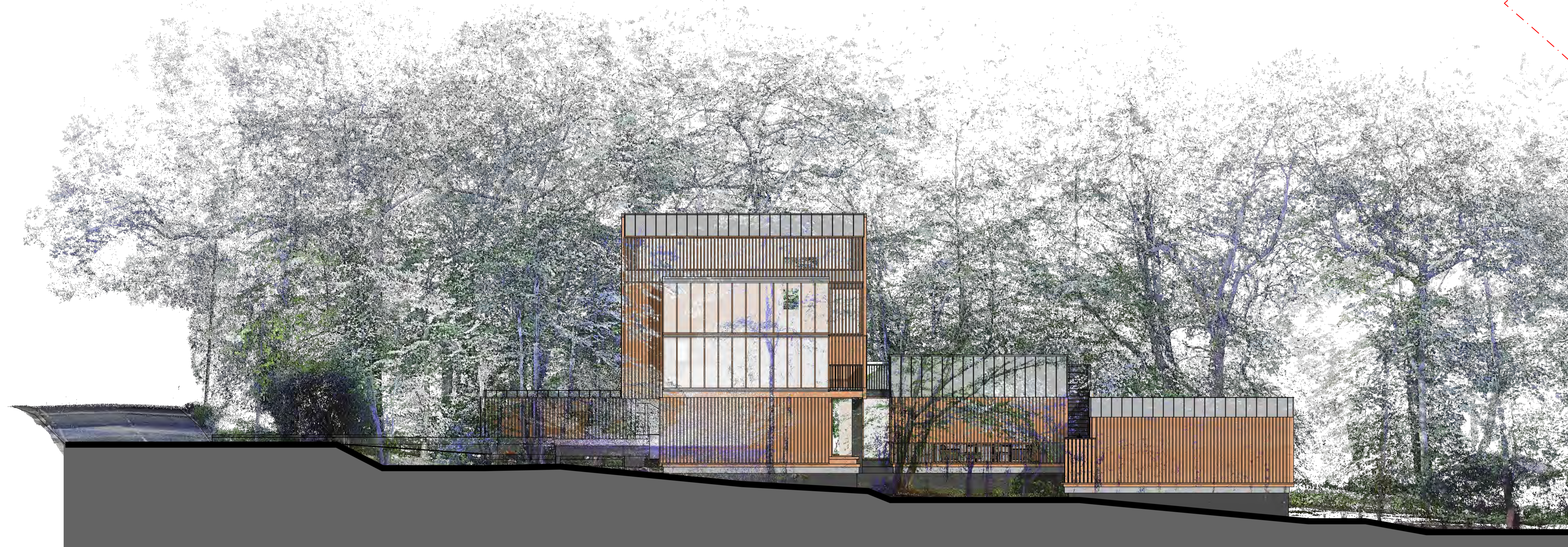
South East Elevation (with trees)