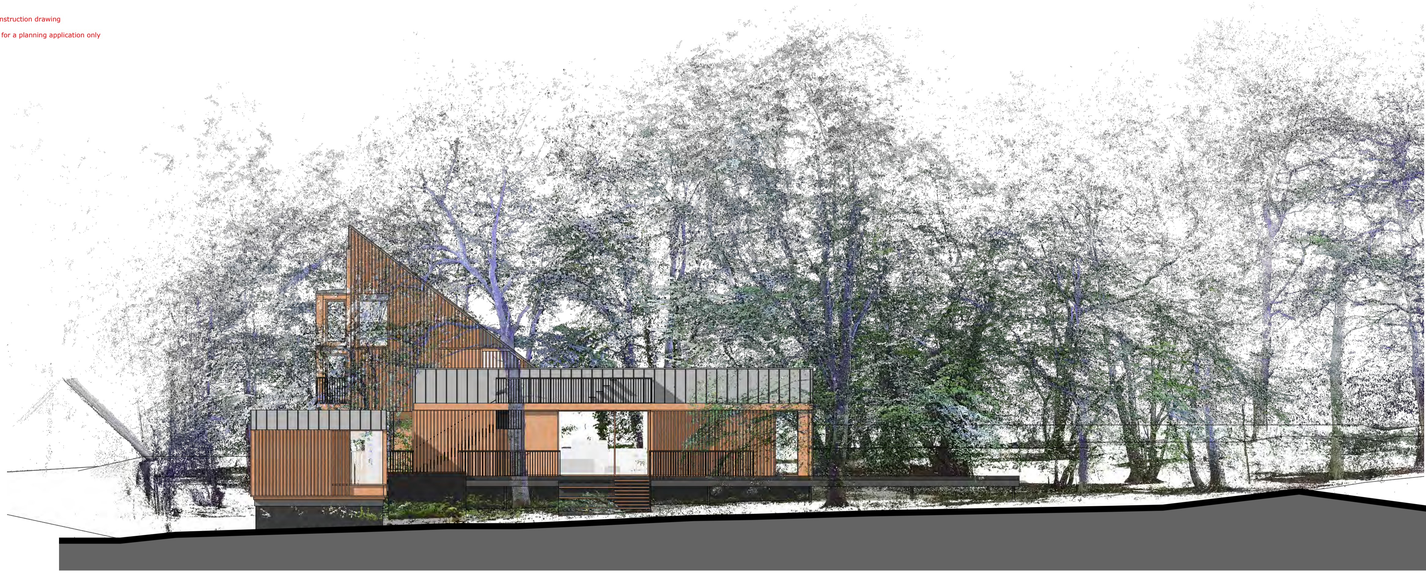
North East Elevation (with trees)

This drawing is copyright. All rights reserved. This drawing is not to be scaled: work from figured dimensions only. Adam Burgess Architect is not responsible for Boundary information - All boundaries are to be confirmed with Land Registry prior to start on site. This is not a construction drawing This drawing is for a planning application only