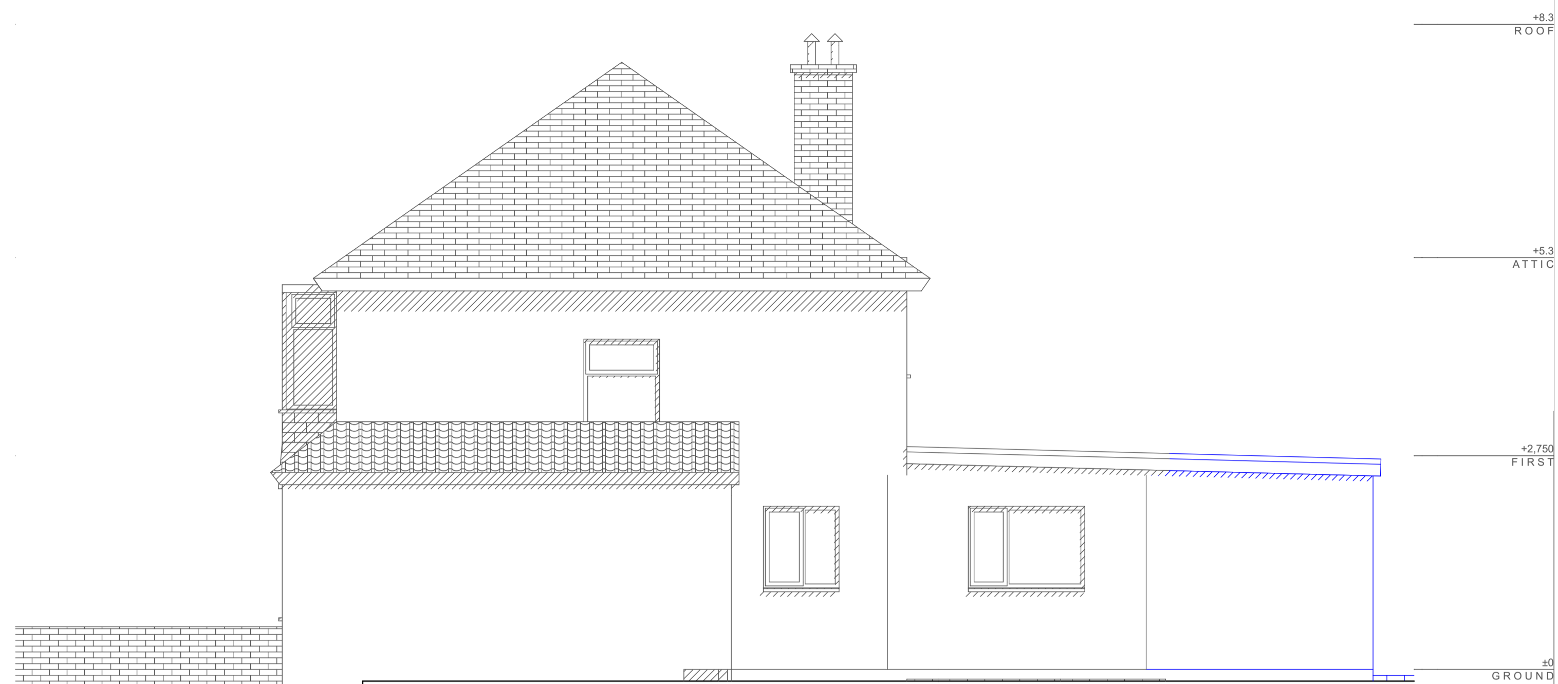
PROPOSED NORTH ELEVATION 1:50