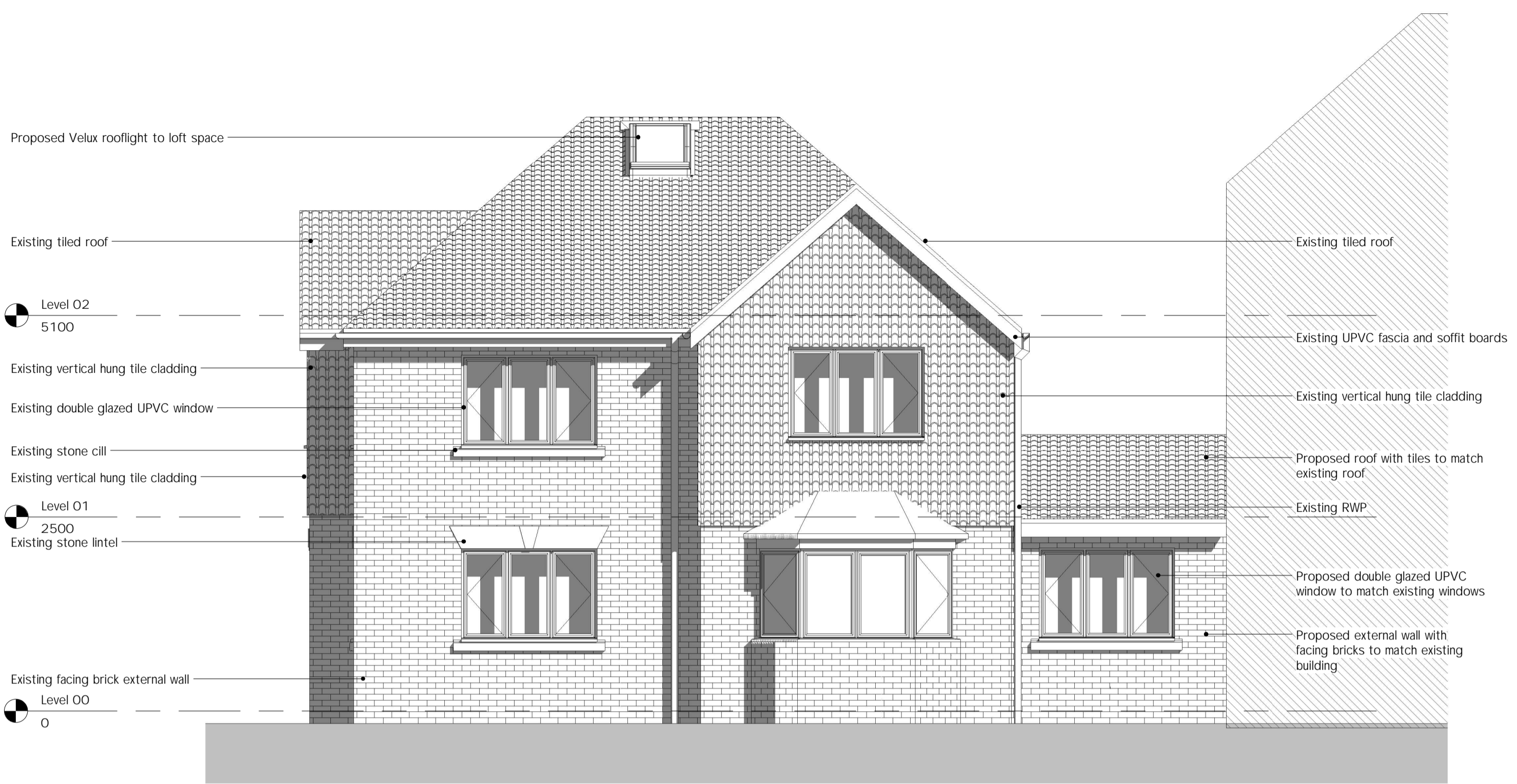
1 Proposed Front Elevation 1 : 50