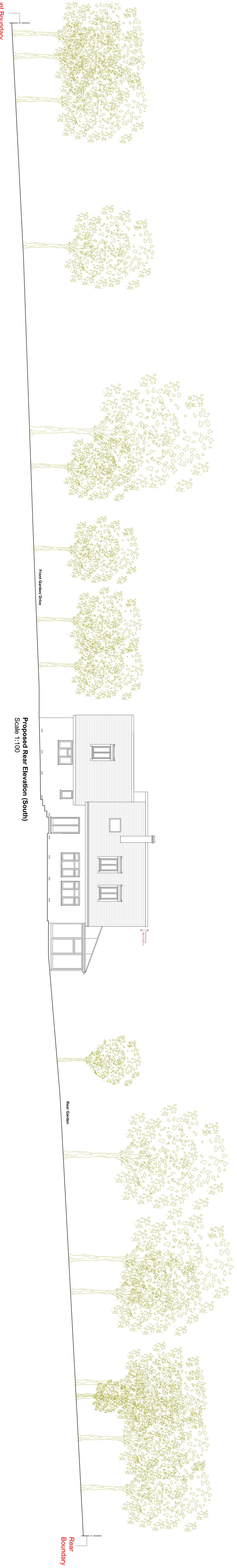
Proposed Rear Elevation (South) Scale 1:100