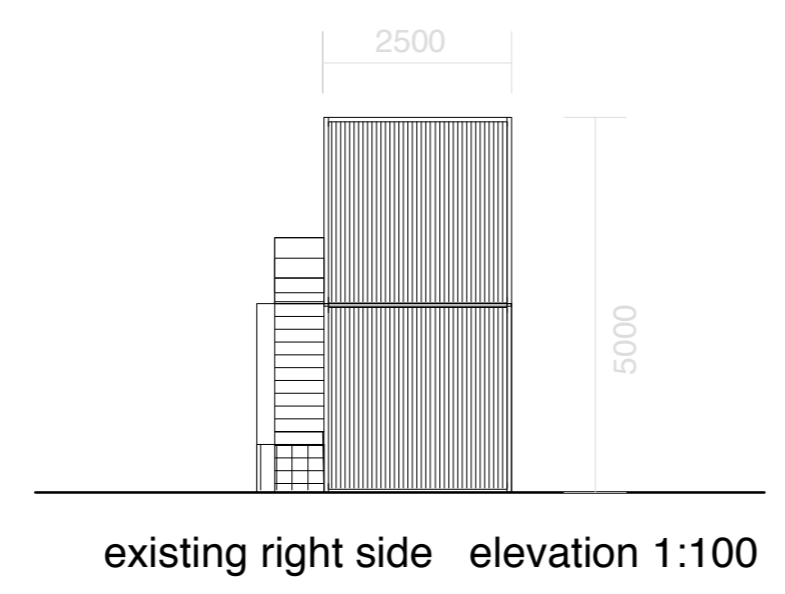
existing right side elevation 1:100