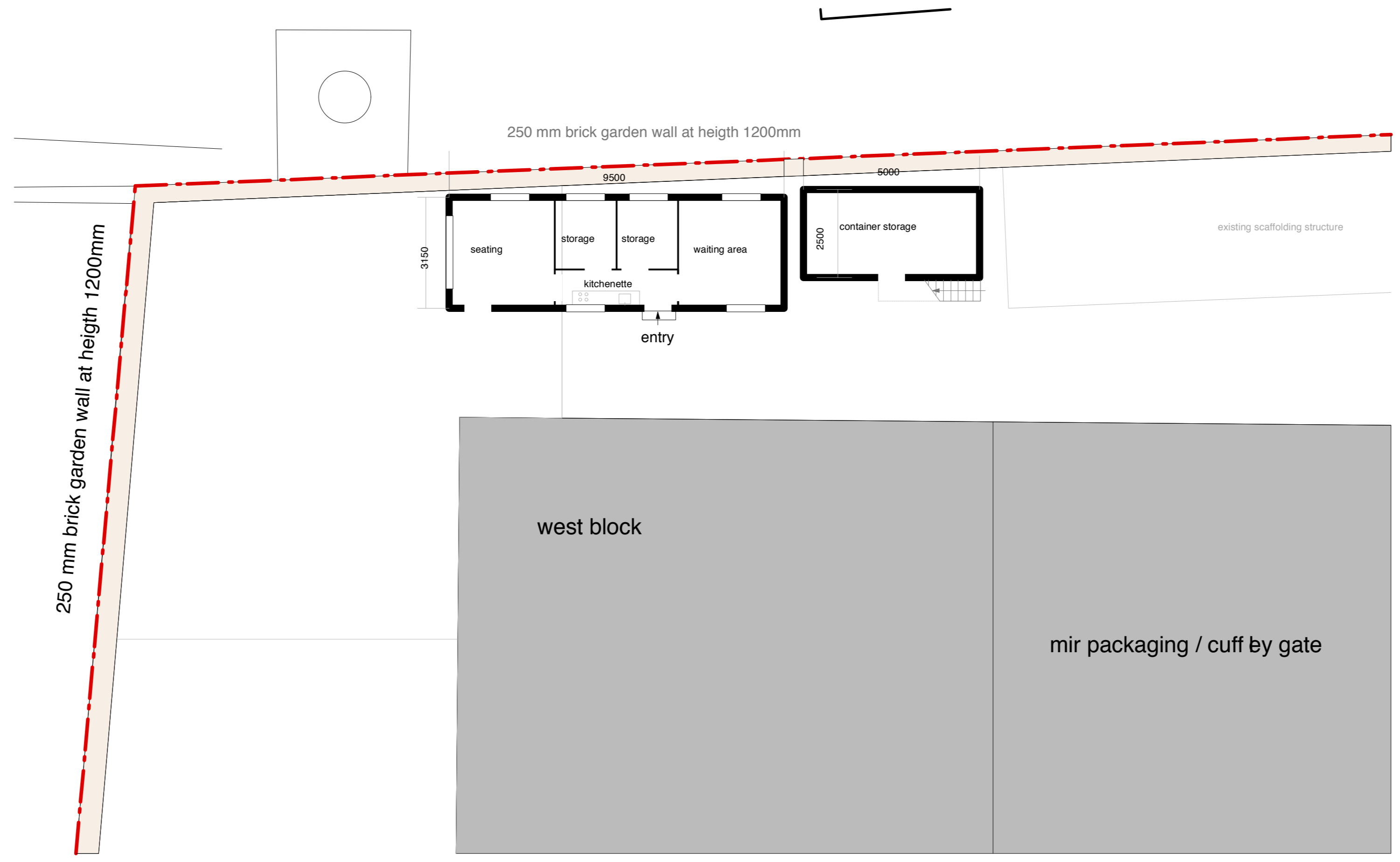
existing floor layout plan @ 1:200