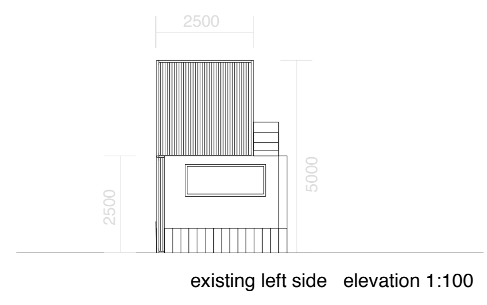
existing left side elevation 1:100