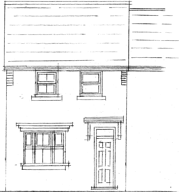
EXISTING FRONT ELEVATION (UN-ALTERED)