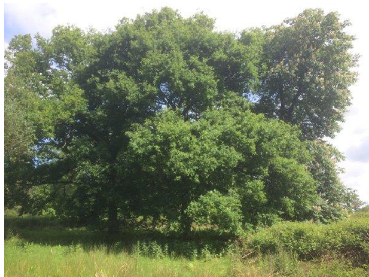
Trees in wooded area at south of site (T11 - 13)