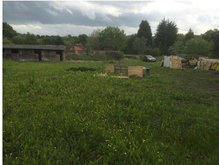
View of dilapidated stable buildings at north east of site.