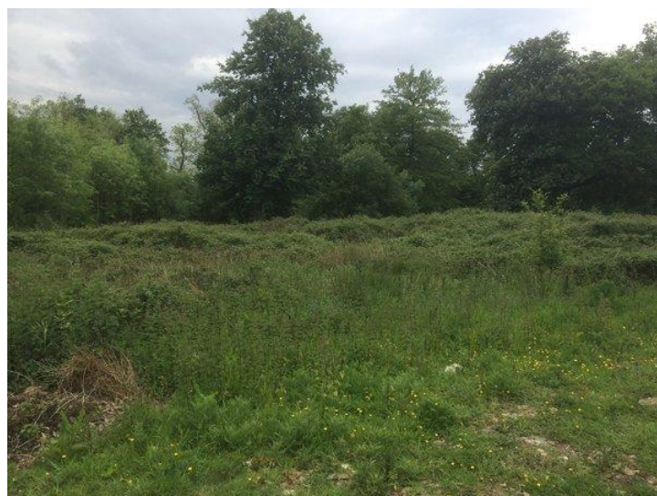
View from north of site looking towards wooded area to south