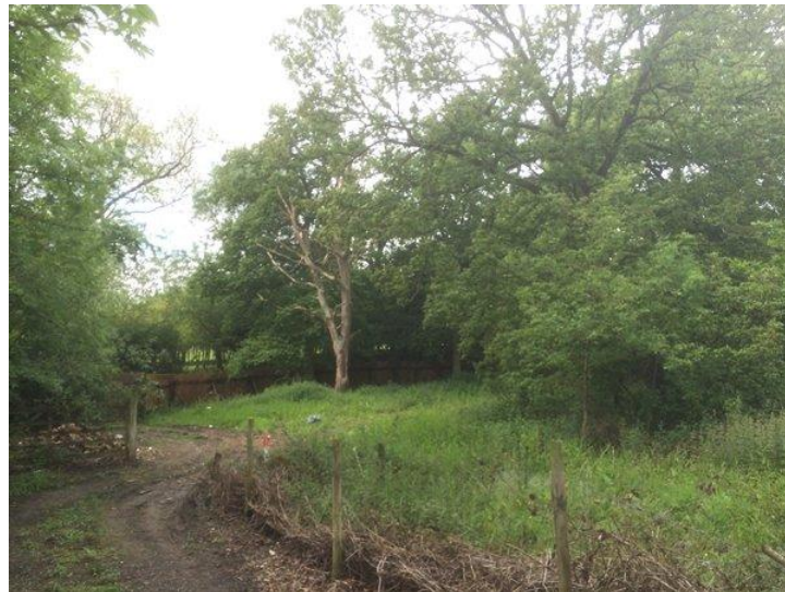
Existing site entrance and track (T1 to right)