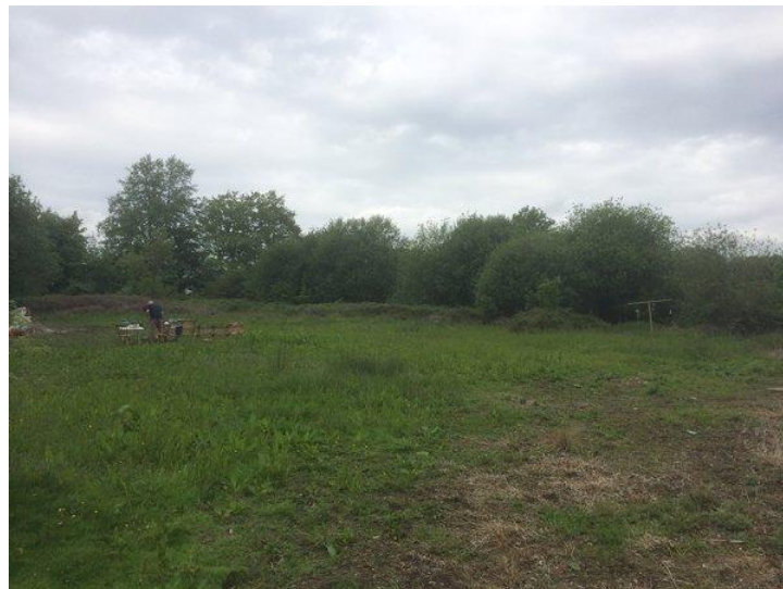
View from stables looking west.