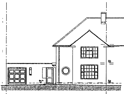
Existing principal elevation facing onto Parkway

The design is sympathetic in terms of scale, height, proportion, form and material in relation to the building itself and those adjacent, and proposes a solution that is in keeping with the appearance of the conservation area within which it resides. The principal construction materials will be brick to match the module, texture, colour and size of the existing dwelling house. Windows and doors shall be chosen to match the style of existing whilst allowing for good daylight to penetrate the house.