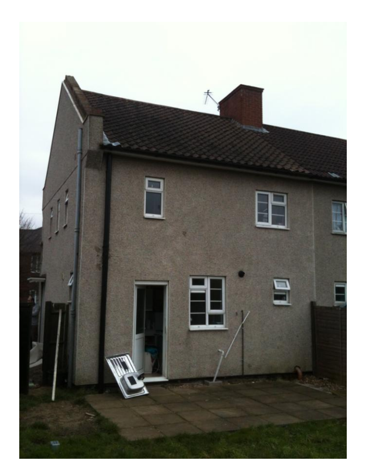
Photograph 3 – Rear Elevation of the Property Arch Planning & Licensing