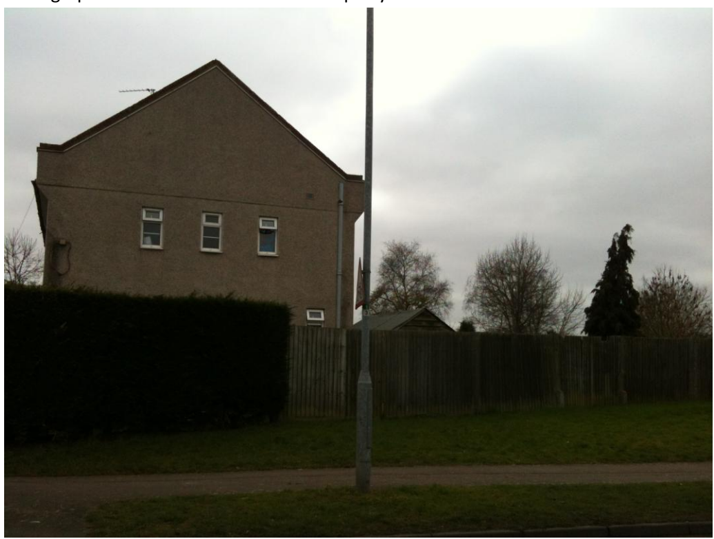
Photograph 2– Side Elevation of the Property