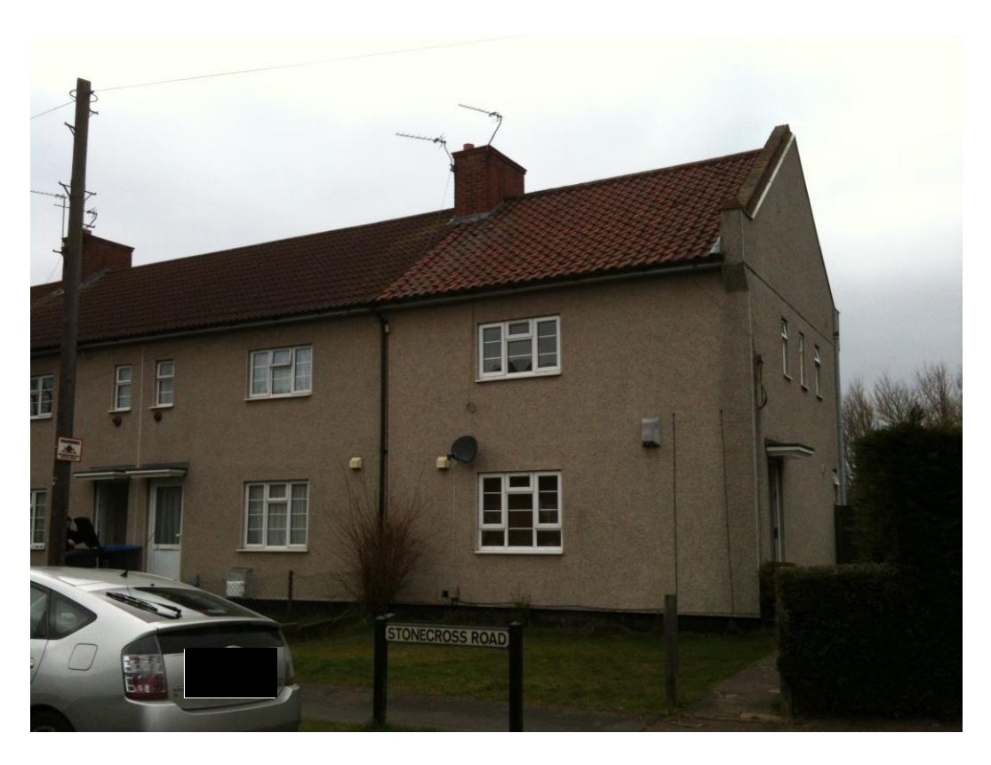
Photograph 1 – Cross Elevation of the Property