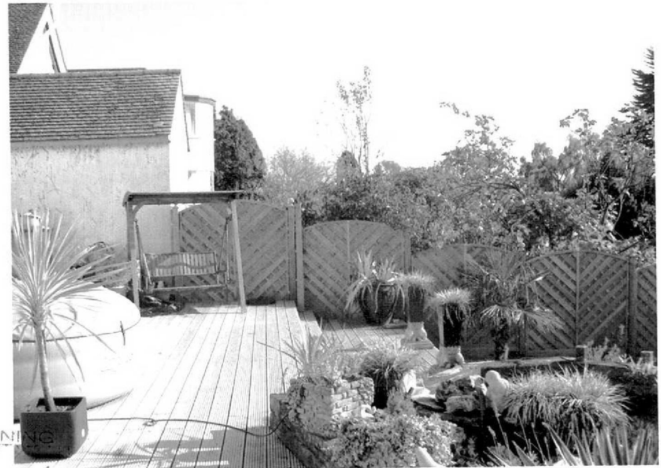
VIEW FROM MID LEVEL TOWARDS NO. 81