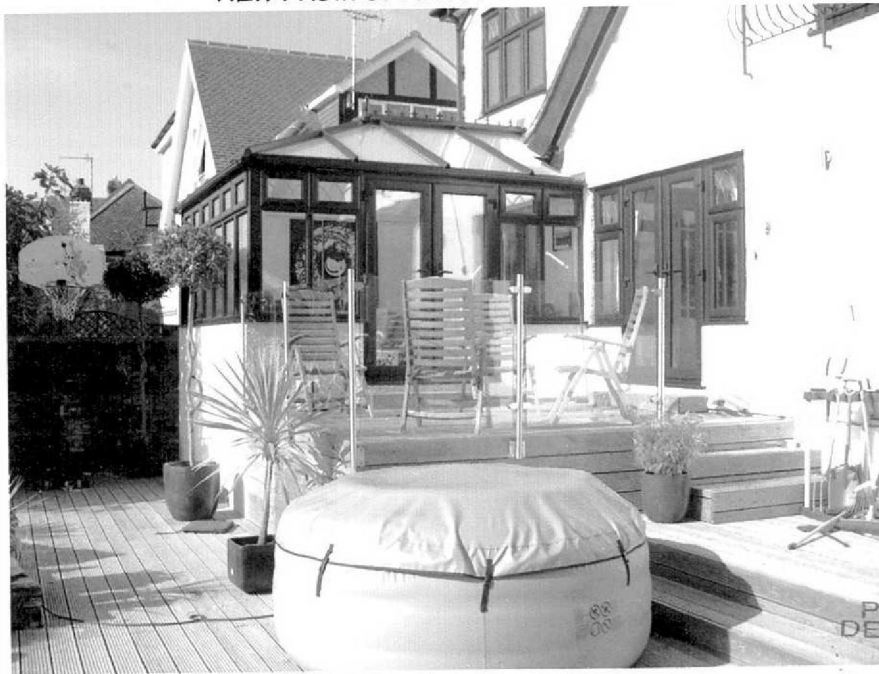
VIEW FROM MID LEVEL TOWARDS NO. 85