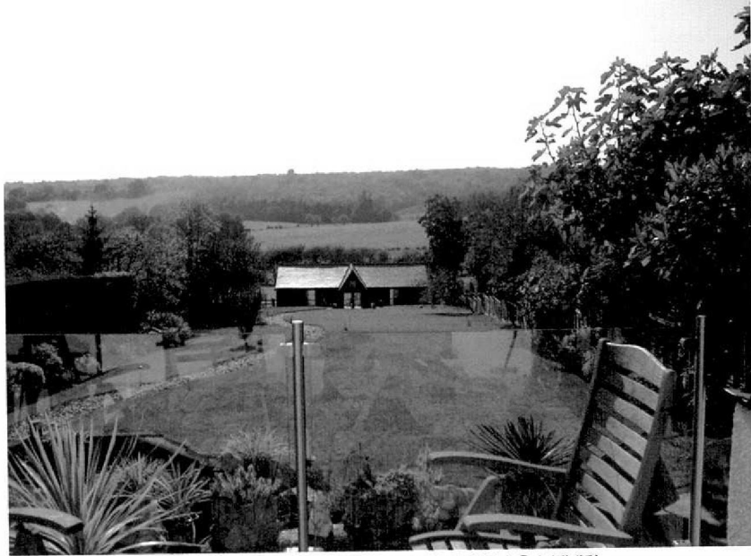
VIEW FROM UPPER DECKING LEVEL