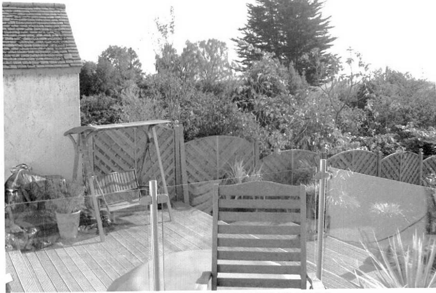
VIEW FROM UPPER DECKING LEVEL