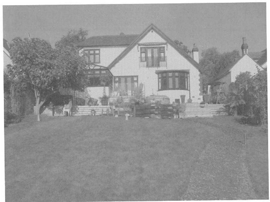
VIEW FROM GARDEN