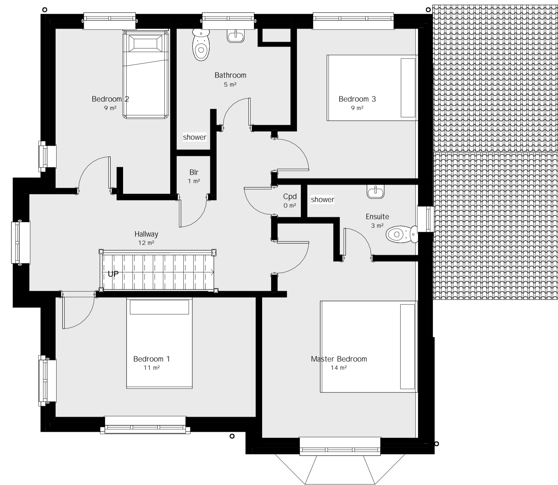
2 01 - First Floor Existing 1 : 50