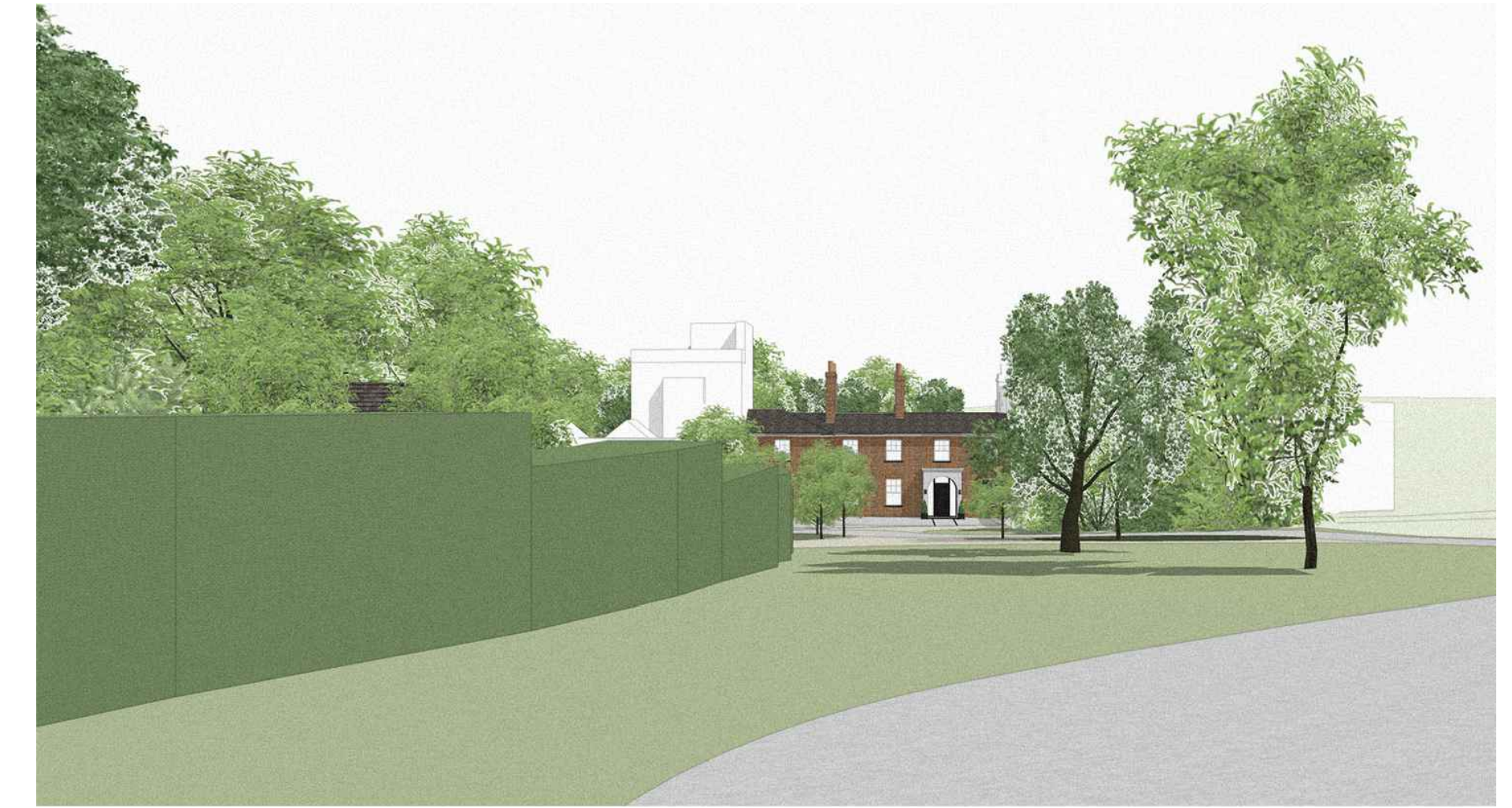
COMPUTER GENERATED IMAGE - VIEW FROM TOP OF DRIVE