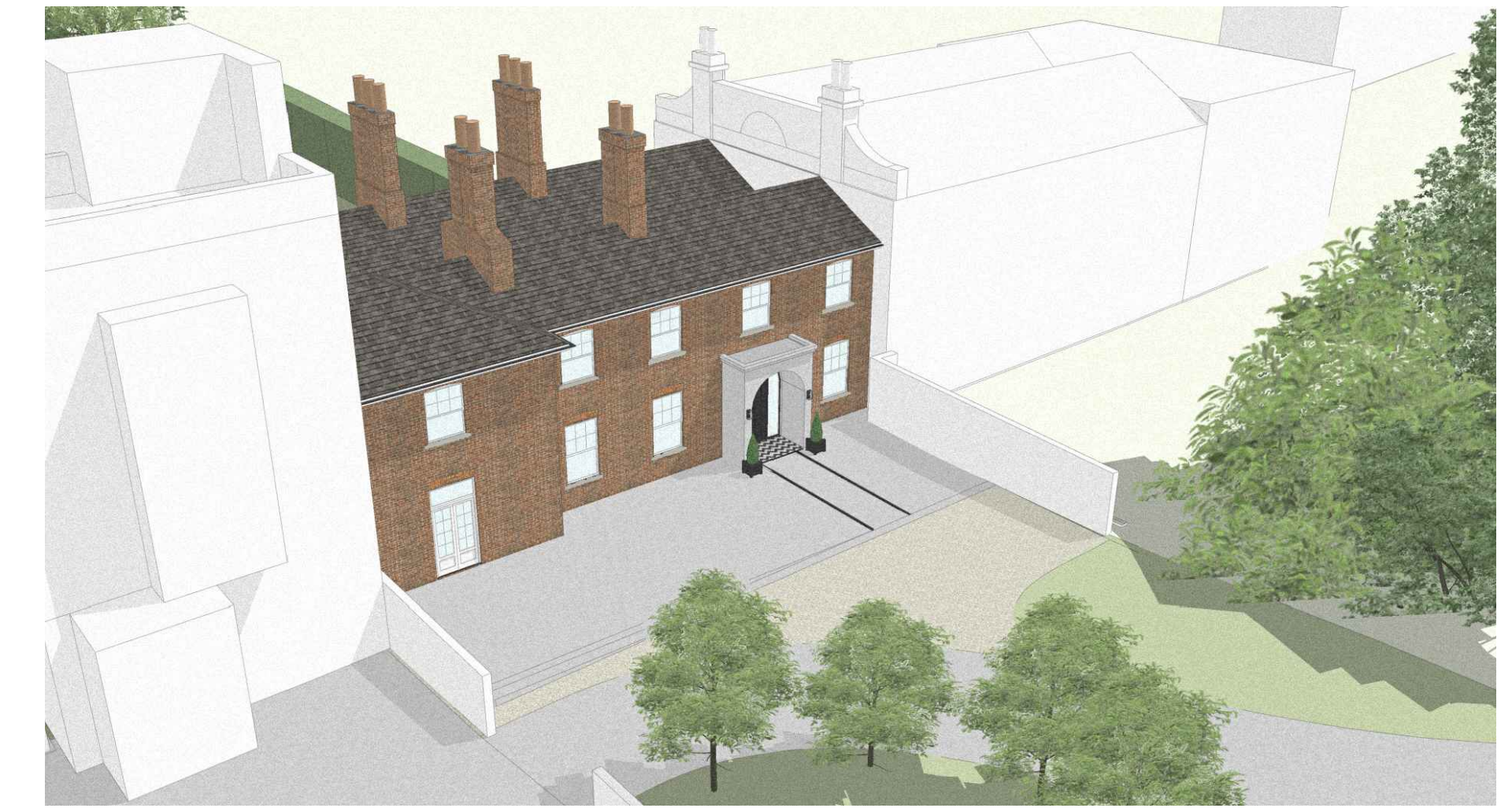
COMPUTER GENERATED IMAGE - FRONT