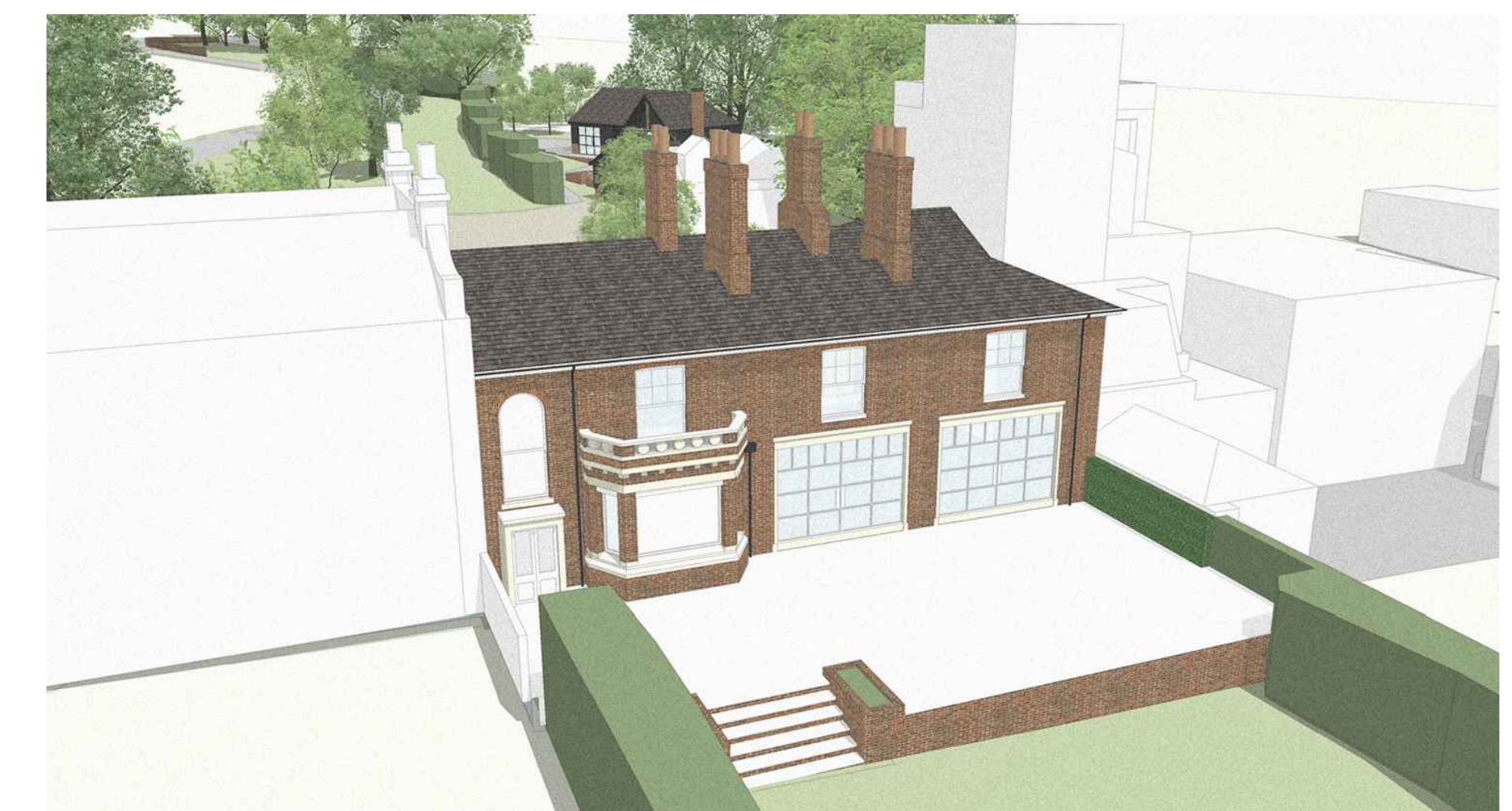
COMPUTER GENERATED IMAGE - REAR