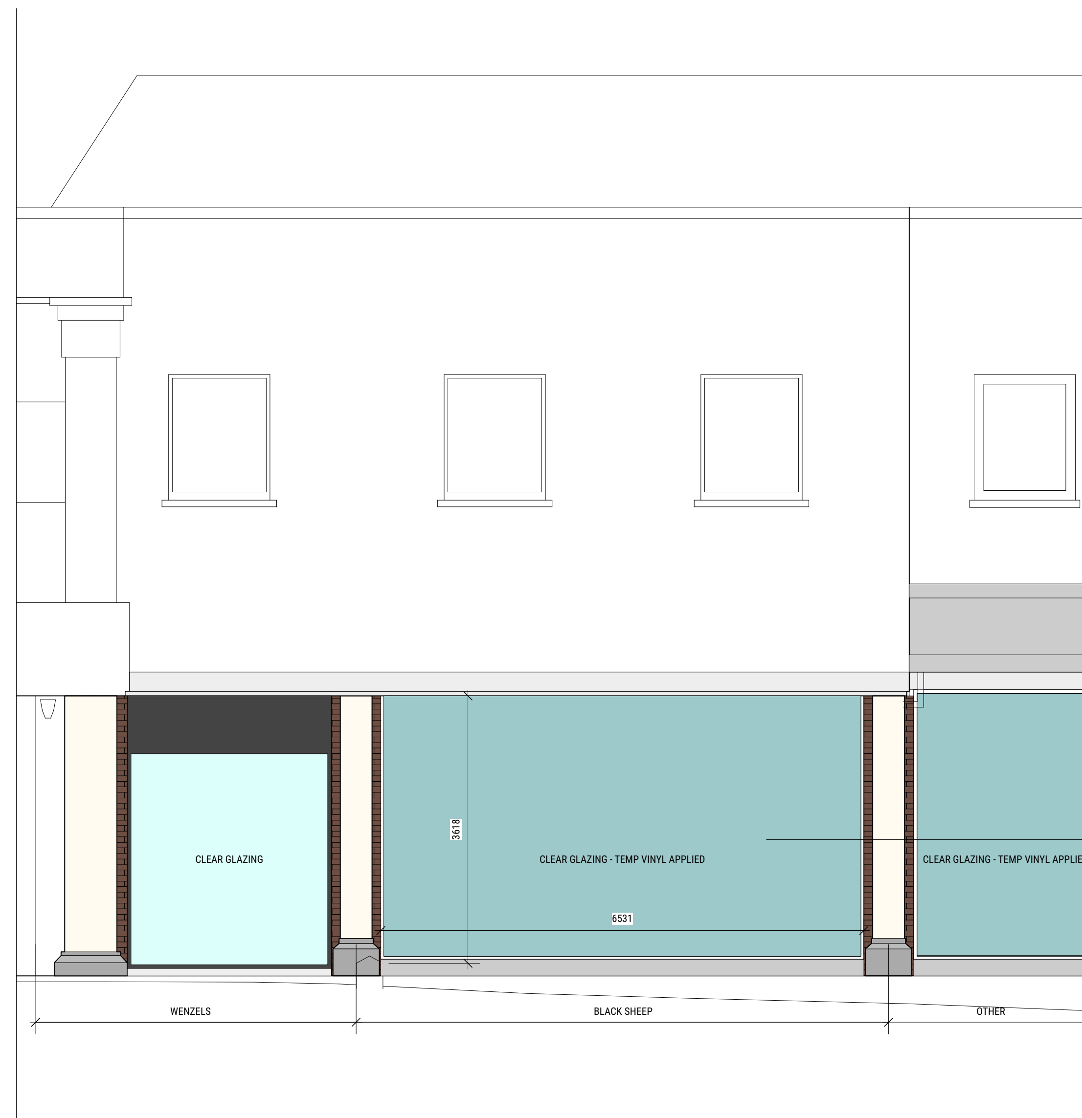
2 ELEVATION BB - EXTERIOR Scale: 1:50

THE EXISTING GLAZED SHOPFRONT IS BEING REPLACED TO CREATE A NEW ENTRANCE FROM THE EXTERIOR SUBJECT TO A SEPARATE PLANNING APPLICATION BY THE LANDLORD - REFER TO PLANNING APPLICATION 6/2024/0986/FULL