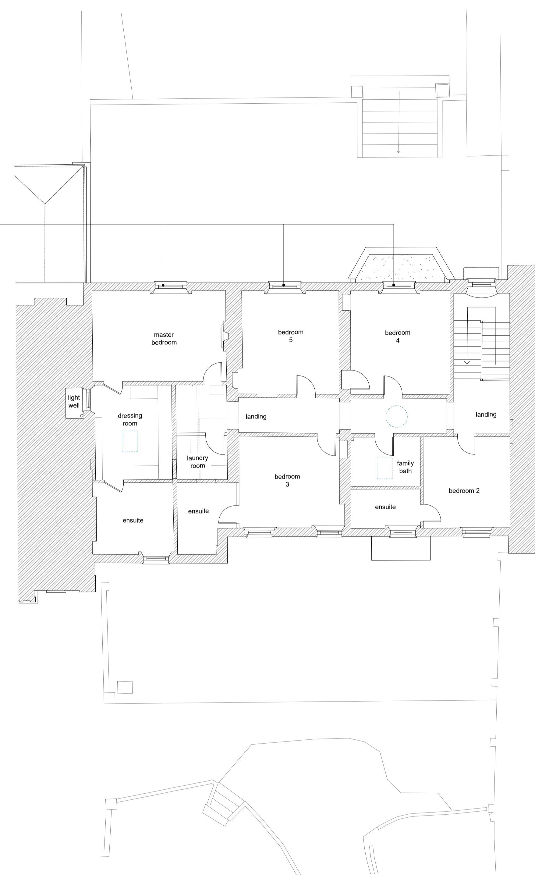
PROPOSED FIRST FLOOR PLAN 1:100 @ A1

NEW FRONT DOOR POSITION TO MAKE PRIMARY ENTRANCE CLEAR AND OBVIOUS