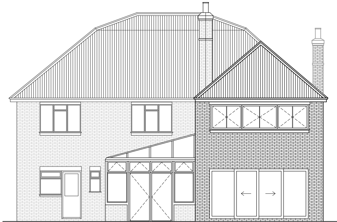
Rear Proposed Elevation 1:100