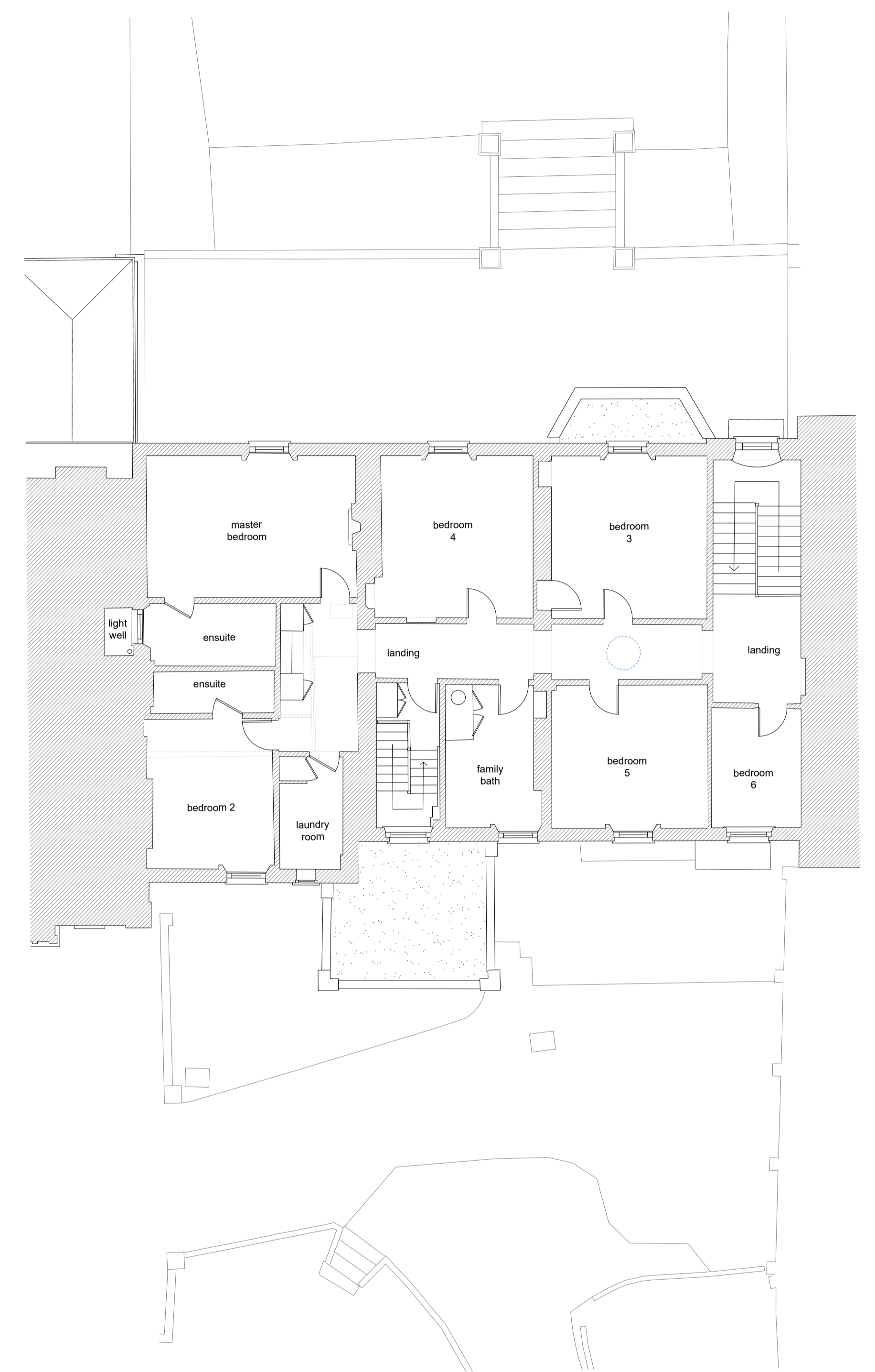
EXISTING FIRST FLOOR PLAN 1:100 @ A1

NOTES: 1. DRAWING TO BE USED FOR THE STATUS INDICATED ONLY. 2. ALL DIMENSIONS AND SETTING OUT SHALL BE CHECKED AND CONFIRMED AND ANY DISCREPANCIES TO BE REPORTED TO THE ARCHITECT PRIOR TO COMMENCEMENT OF ANY WORK. 3. ALL WORK AND MATERIALS TO BE IN ACCORDANCE WITH CURRENT STRUCTURAL REGULATION, RELEVANT CODES OF PRACTICE AND BRITISH STANDARDS. 4. DRAWING TO BE READ IN ACCORDANCE WITH RELEVANT CONSULTANTS AND SUB-CONTRACTORS DRAWINGS AND SPECIFICATIONS. 5. THIS DRAWING IS THE PROPERTY OF JW BESPOKE LIMITED AND IS NOT TO BE USED IN WHOLE OR IN PART WITHOUT WRITTEN CONSENT.