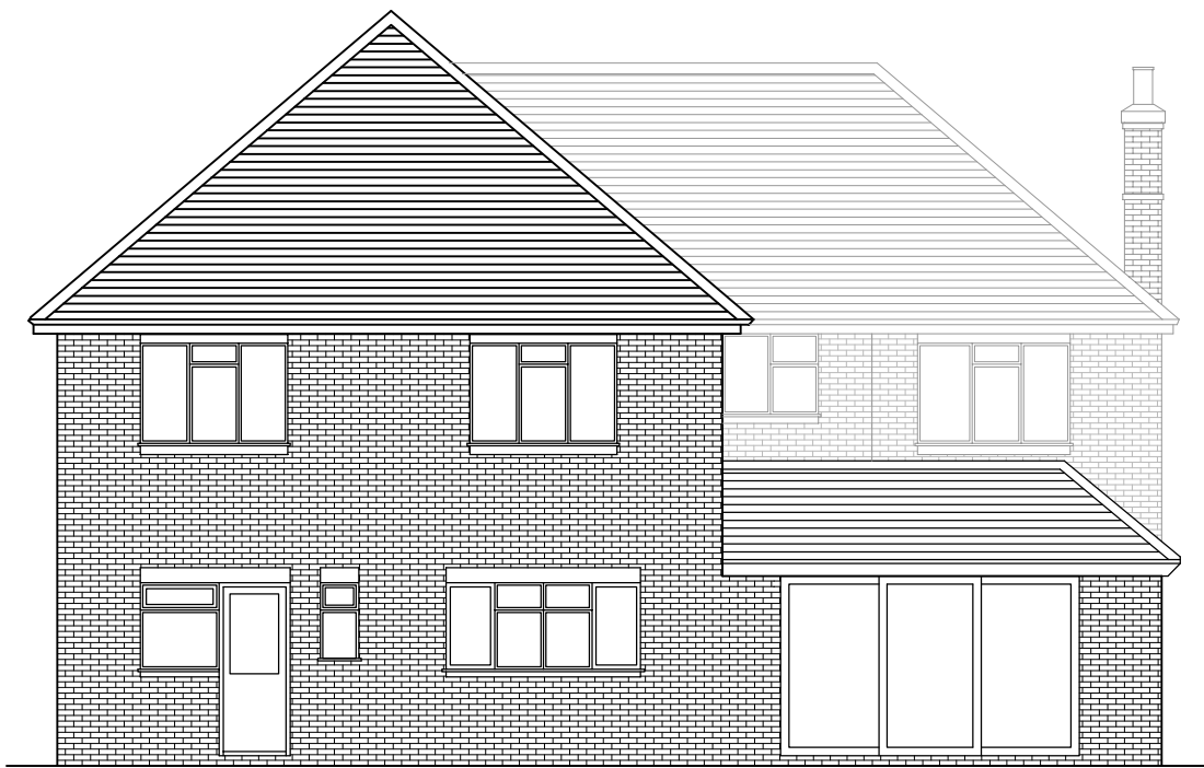
Rear Existing Elevation 1:100