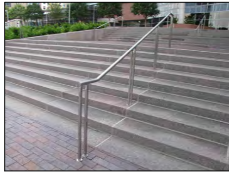
Handrails: Handrail Direct Components 1000mm high or similar approved ( https://www.handrailsdirectcomponents.co.uk/index.php?route=_components&gclid=CP2Die21yQCF5i-7QodIDIBxQ )