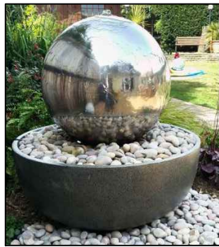
Entrance water feature: Primrose 50cm Giant Eclipse Stainless Steel Sphere Water Feature or similar approved ( https://www.primrose.co.uk/p-55740.html ?adtype=pla&kwid=&gclid=COv16W0y0QC Famw7QodEwoISQ)