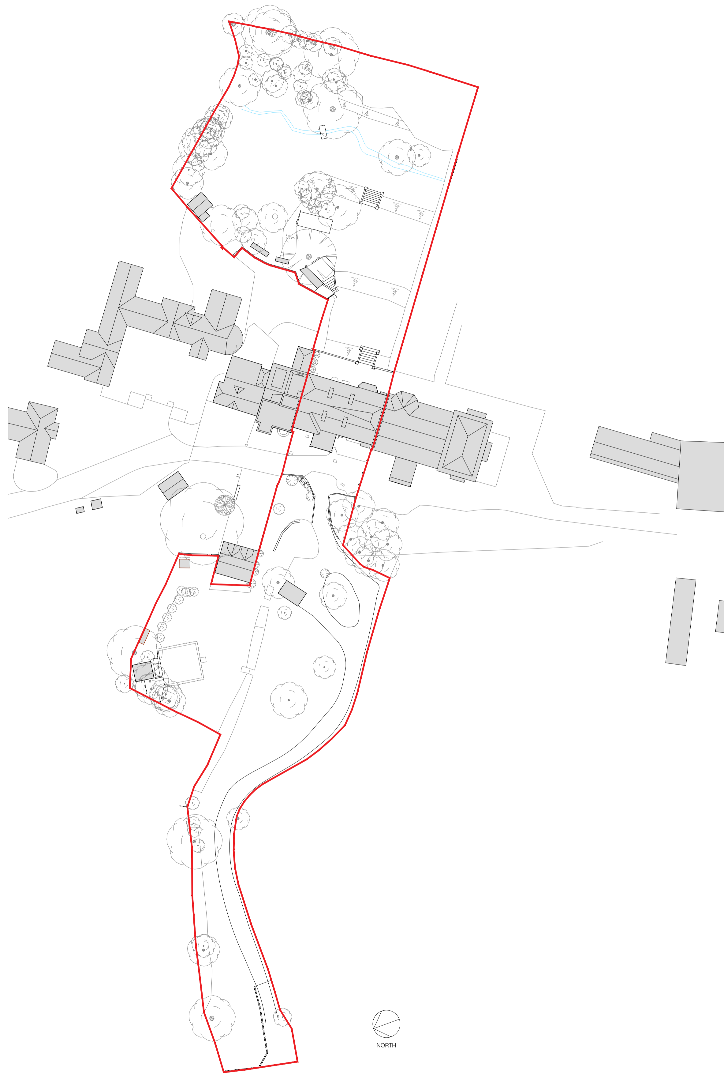
EXISTING SITE PLAN 1:500 @ A1

BASED ON PROFESSIONAL TOPOGRAPHICAL SURVEY BY AMU SURVEYS LTD.