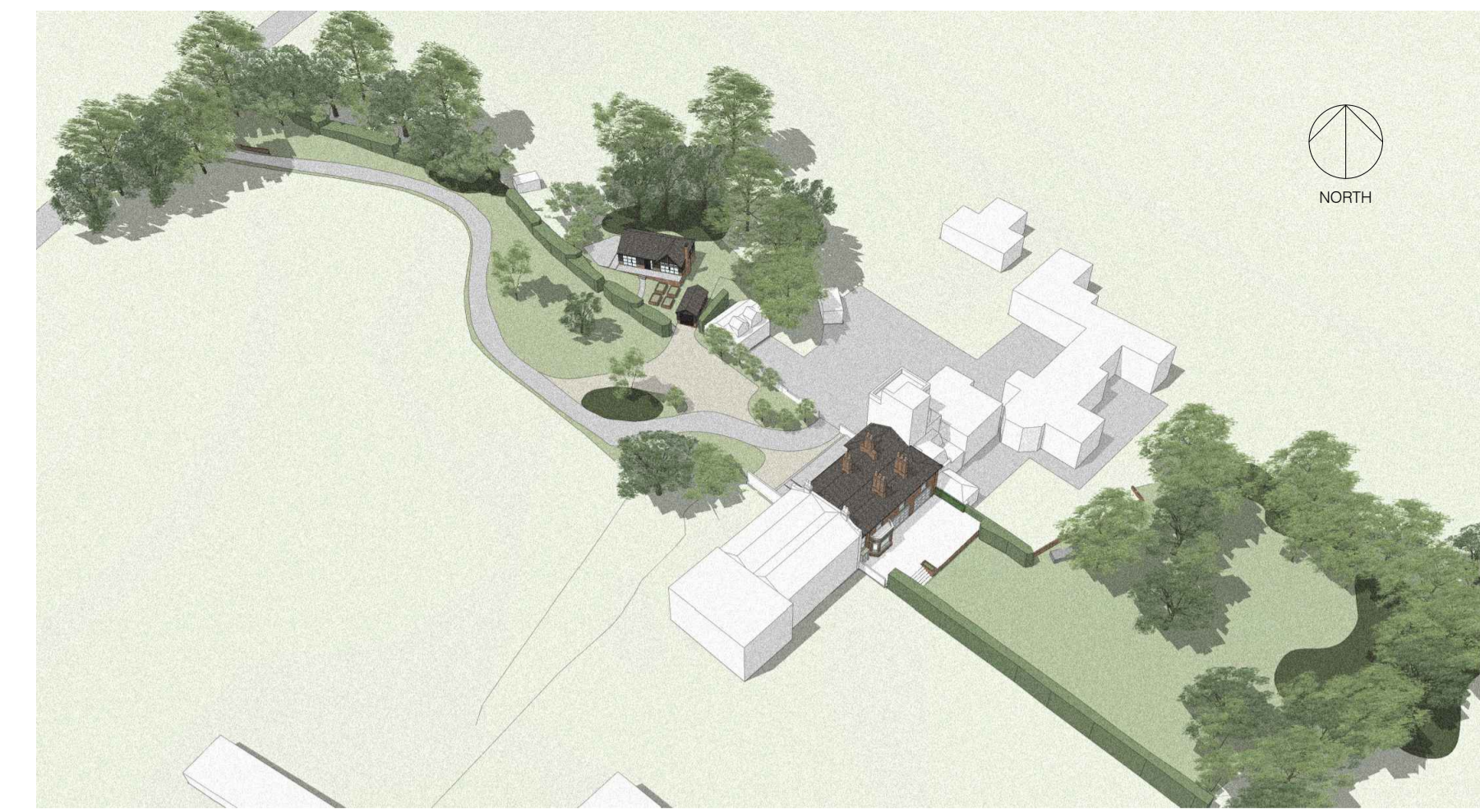
COMPUTER GENERATED IMAGE - OVER VIEW

BASED ON PROFESSIONAL TOPOGRAPHICAL SURVEY BY AMU SURVEYS LTD.