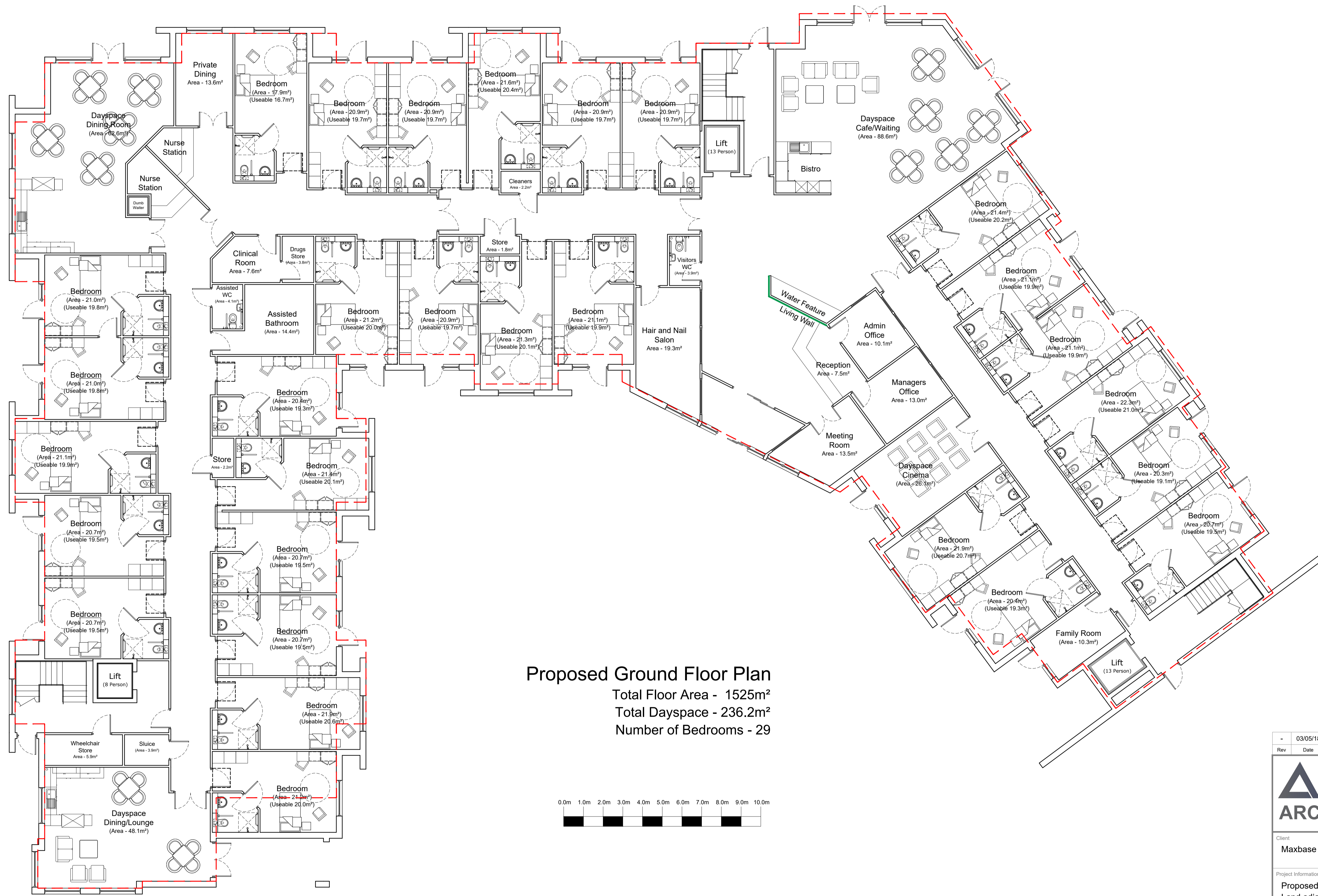
Proposed Ground Floor Plan Total Floor Area - 1525m 2 Total Dayspace - 236.2m 2 Number of Bedrooms - 29